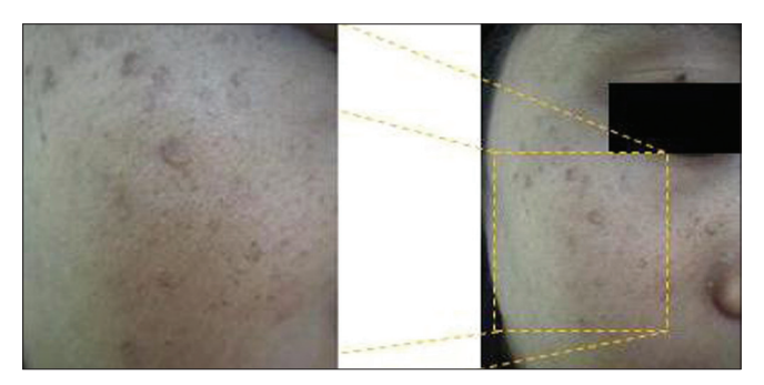
Figure 4: Peri-lesional hyperpigmentation — the freckles have cleared, but a rim of surrounding hyperpigmentation remains