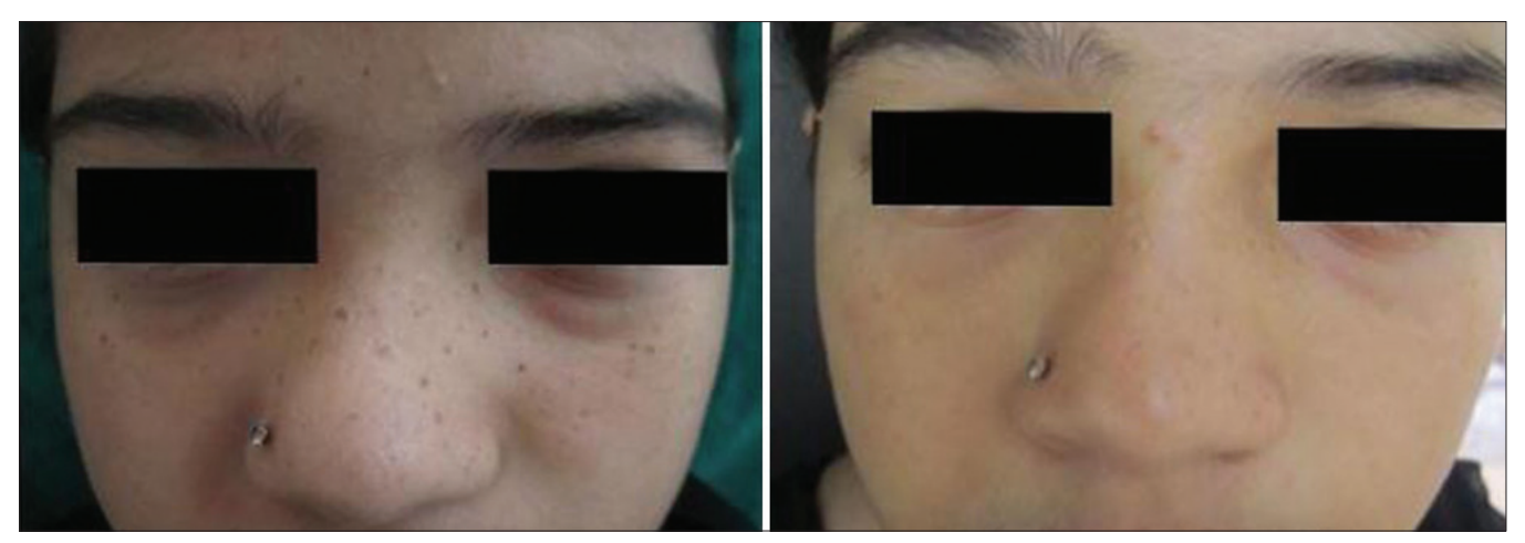
Figure 1: A 10-year-old girl treated showed complete resolution on both sides. Both the right side and the left side of the face showed equivocal response