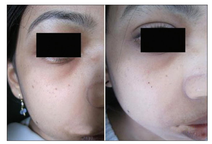
Figure 3: A close-up photograph to compare the efficacy of both agents. The right side where TCA was applied shows fewer scabs present but a few freckles seem to have reappeared