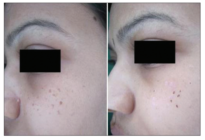
Figure 2: A close-up photograph to compare the efficacy of both agents. The left side (phenol peel) shows transient hypopigmentation with retention of a few scabs on the seventh day. The right side where TCA was applied shows fewer scabs present, but a few freckles seem to have reappeared