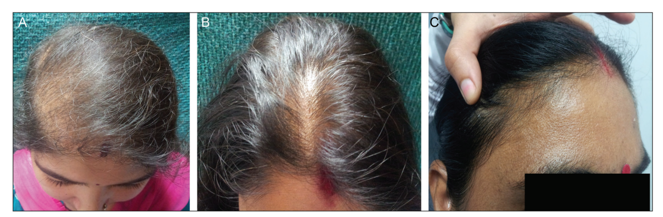
Figure 1: Different patterns of hair loss: (A) Ludwig pattern, (B) Olsen pattern, and (C) Hamilton and Norwood pattern

The chi-square test showed a statistically significant association between raised free testosterone (fT) levels and Hamilton and Norwood pattern of baldness (P < 0.000). A single patient with Hamilton and Norwood pattern had significantly raised levels of fT.