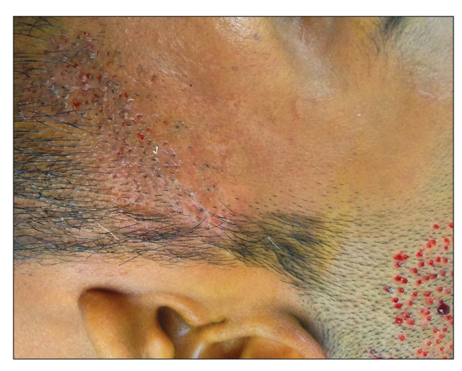
Figure 2: Single follicle units extracted from scalp and implanted over the recipient and affected area on the left cheek