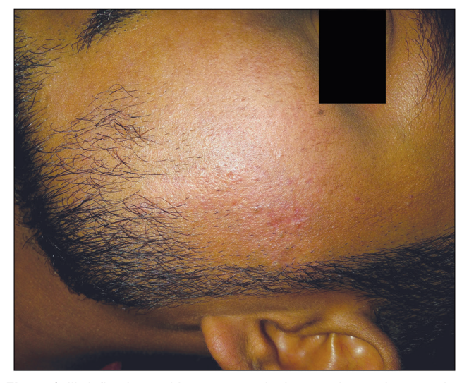
Figure 1: III-defined, atrophic, normoaesthetic, macular patch measuring around 4 \times 2 cm on left cheek with overlying poor hair growth

Leprosy is a disease associated with considerable physical, social, and psychological stigma. For the patient as well as the public, it is not really cured as long as its morbidity due to disabilities continues.[1]Apart from physical disabilities, cosmetic disabilities secondary to leprosy are of significant concern for the patient, one of these being hair loss. Hair loss occurs not only as part of specific disability as madarosis in lepromatous leprosy, but also in skin lesions of tuberculoid pole due to peri-appendageal inflammation, as was seen in our patient. [2] Scalp hairs are usually spared due to higher temperatures over scalp, but even these might be involved rarely.[3] Cosmetic surgeries for hair restoration have been tried for madarosis in leprosy patients in the past with good outcome.[4] To alleviate cosmetic concerns of our patient, we performed FUE procedure over the burnt-out patch of BT leprosy over his left cheek with a good clinical outcome and to our patient's satisfaction. The FUE procedure holds promise in the correction of hair loss in leprosy patients, especially if the cosmetic defects are over hair-bearing visible areas of the body, and thus can help in alleviating the stigma when used judiciously in suitable cases.