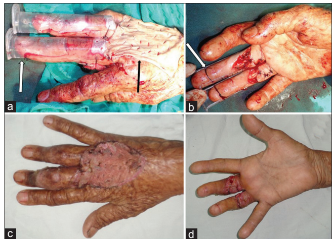
Figure 2: (a) Syringe splint on middle and ring fingers and skin graft on right hand. (b) Release of contracture by Z-plasty incision and syringe splint. (c) Dorsal aspect of healed and straightened contracted fingers on removal of splint. (d) Ventral aspect of healed and straightened contracted fingers on removal of splint