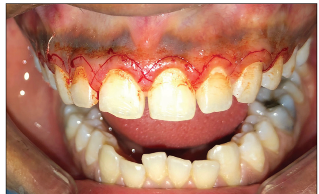
Figure 3: Incision of crown lengthening marked