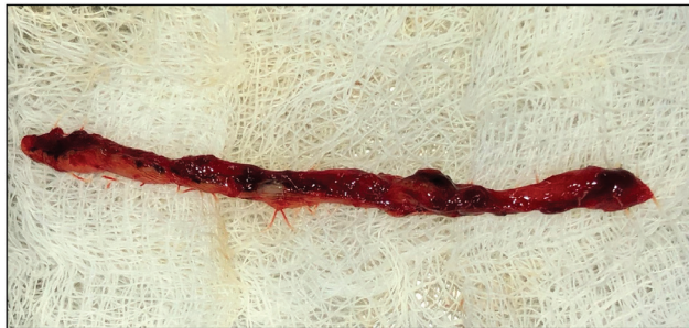
Figure 5: Band of partial thickness tissue excised between the incision lines