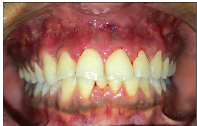
Figure 9: Posttreatment: two weeks healing by scarring