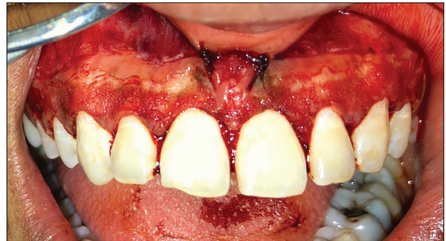
Figure 7: Midline suture placed repositioning the lip midline with depigmentation of pigmented patches with electrocautery

When a person smiles, the crowns of maxillary central incisors and 1 mm of pink attached gingiva are evident. Approximately 2–3mm of exposed gingiva can be cosmetically acceptable if it is not unduly conspicuous. In this case, after one month of healing, there was 2 mm