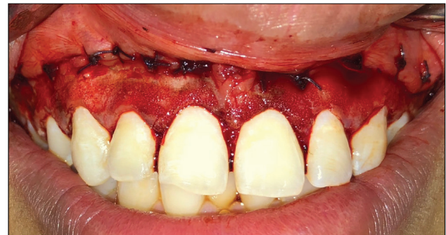
Figure 8: Equidistant sutures placed