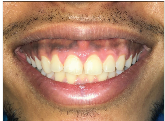
Figure 2: Pretreatment: smile showing small teeth and a high smile line and a wide smile extending to first molars on either sides