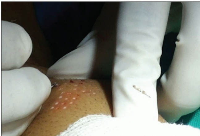
Figure 3: Follicular unit extraction from thigh

continues up to 6 months or even longer. [3] Transformation of depigmented hairs into pigmented hairs has been reported following FUT, as seen in our case also. [4] Non-cultured extracted hair follicular outer root sheath (ORS) cell suspension transplantation has also been tried with 65.7% repigmentation. [4] BHT by FUE circumvents the need of tedious melanocyte suspension process.