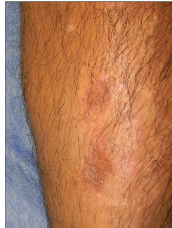
Figure 4: The 3-month result with 100% pigmentation, but with evidence of previous scar and slight hyperpigmentation

treating localized/segmental vitiligo, especially on hairy parts of the skin, including the eyelids and eyebrows and for small areas of vitiligo. As seen in our case, even density of 6-8 FU/cm 2 was sufficient to induce complete pigmentation. The best application of this method will be in vitiligo patches with leukotrichia. In cases of focal vitiligo with scarring/loss of hairs, this procedure could be considered as the procedure of choice.