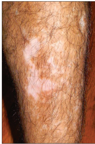
Figure 1: Baseline photograph before starting medical treatment