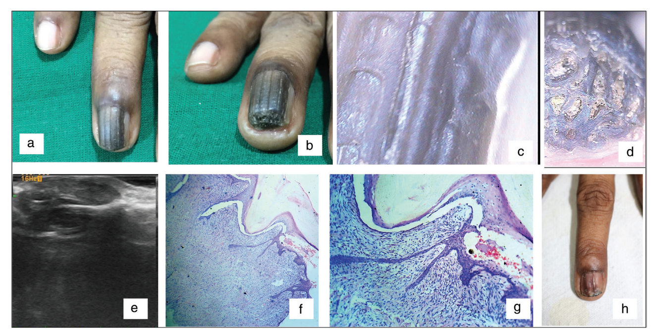
Figure 2: Case 2. (A, B) Longitudinal melanonychia with linear subungual mass lesion with increased curvature of nail plate. (C, D) Dermoscopy: multiple linear grooves on the nail plate and multiple concentric areas containing yellowish material. (E) High-frequency ultrasonography: thickened nail plate, multiple circular hyperechoic bands within it. Hypoechoic nail bed compressed by the tumor. (F, G) Fibroepithelial tumor with filiform projection of dermis covered with a thin rim of epidermis (hematoxylin–eosin, 40× and 100×). (H) Four months after surgery