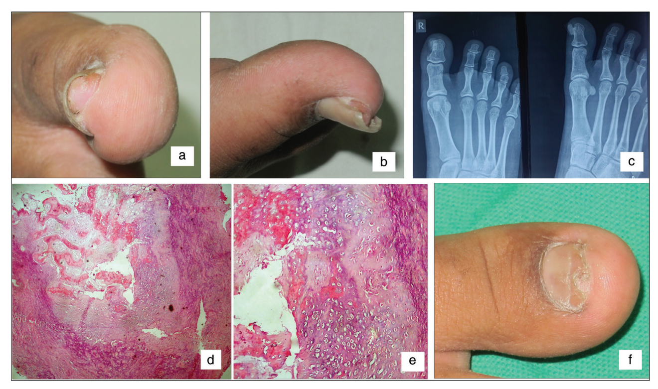
Figure 3: (A) Single firm, fleshy nodule of size 1 \times 1 cm over medial and distal aspect of right great toe, displacing the nail plate (anterior view). (B) Tumor on lateral view. (C) Radiography: radio-dense outgrowth arising from dorsomedial aspect of distal phalanx of right great toe in continuity with medullary canal. (D) Histopathology, mature trabecular bone covered with hyaline cartilage cap (hematoxylin–eosin, 40 \times ). (E) Hyaline cartilage cap containing perichondrium, chondroblasts, and chondrocytes with lacunae. (F) Two months after surgery

distal subungual keratosis.<sup>[1]</sup> The most common clinical presentation of onychopapilloma is localized longitudinal erythronychia, but it can present as chromonychia or