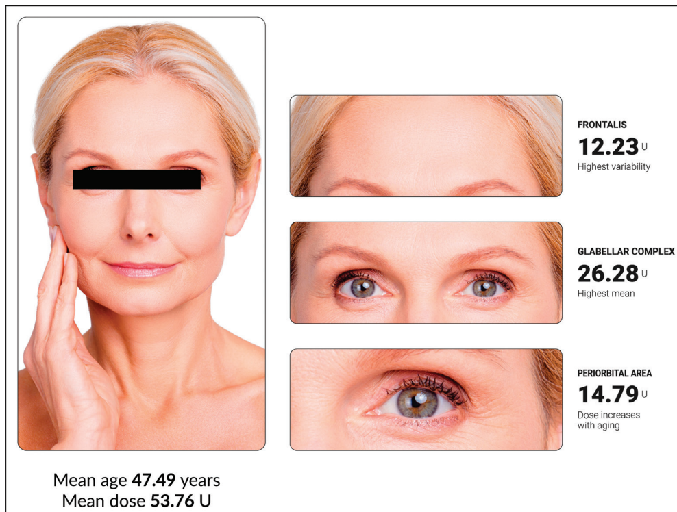
Figure 3: Total mean dose of botulinum toxin type A per area