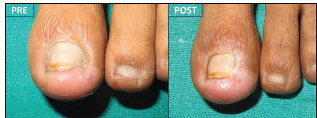
Figure 2: Pre- and postoperative (day14) clinical picture showing quick healing and grade 0 drainage

Matricectomy can be performed by either chemical or mechanical destruction. Chemical matricectomy is usually performed with the help of phenol (88%), trichloroacetic acid (100%), and sodium hydroxide (10%). [4] Though