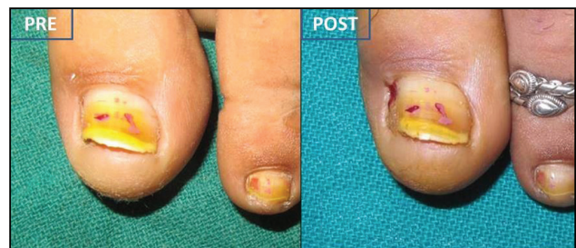
Figure 3: Pre- and postoperative (day14) clinical picture showing grade 0 drainage and fast tissue recovery