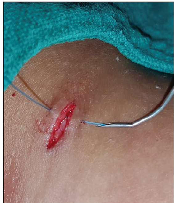
Figure 3: Hypodermic needle being withdrawn after passing suture thread