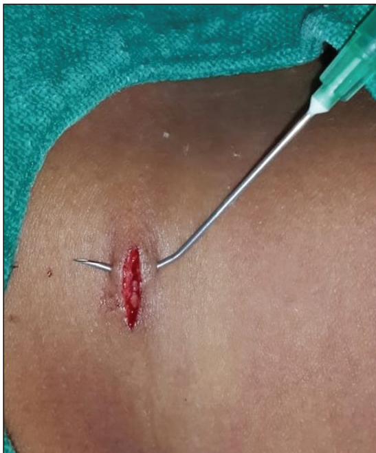
Figure 2: Hypodermic needle (22 G) passed through wound edges