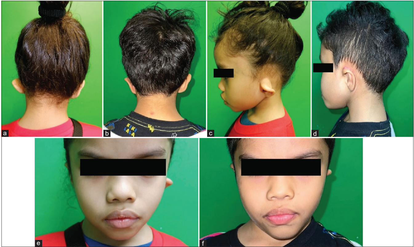
Figure 1: Pre- and postoperative comparison showed good outcome at 6 months post repair of left constricted ear: (a) Preoperative, posterior view showed marked vertical height difference by 1.5 cm and smaller ear size. (b) Preoperative, posterior view showed slight reduction in vertical height by 5 mm and increased ear size. (c) Preoperative, lateral view showed superior lidding of the helix with absent antihelical fold. (d) Postoperative, lateral view showed correction of superior helical lidding with increased vertical height, more superiorly placed ear position and antihelical fold visualized. There was a mild degree of lidding at the anterior helix post correction. (e) Preoperative, anterior view showed a marked vertical height difference by 1.5 cm with superior lidding and protrusion of left ear. (f) Postoperative, anterior view showed an improved vertical height and corrected superior lidding and protrusion of the left ear.

[Figure 2a]. Several passes of needle at four to five places at height of the antihelical fold through the full thickness of the ear had been performed. With each pass of needle, the needle tip was inked and withdrawn to tattoo the cranial aspect of antihelical cartilage.