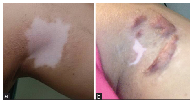
Figure 6: (a) Pre-operative picture. (b) Post operative picture showing keloid in the lateral half treated with split thickness skin graft, no keloid formation in the medial half treated with Jodhpur technique

to compare our results with them. In our study, lesions on thigh, face, trunk, face and lips showed maximal improvement while patches on joints and acral areas did not show much improvement.