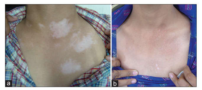
Figure 3: (a) Pre-operative picture. (b) Post-operative picture, 20 weeks post-procedure showing almost complete repigmentation