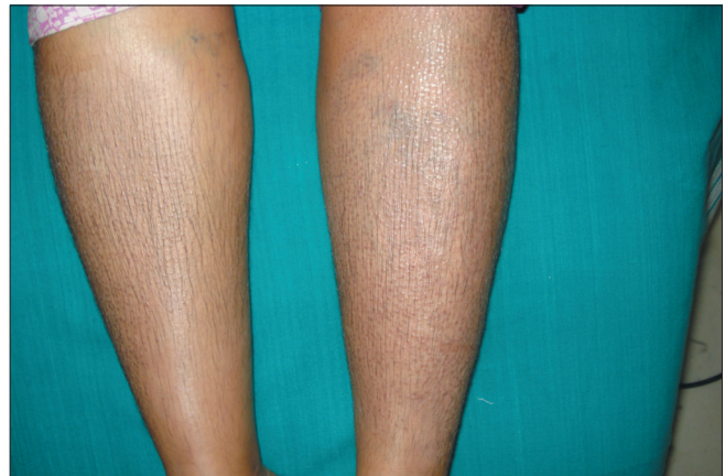
Figure 4: Improvement of the hyperkeratotic lesions seen after 6 sessions of laser treatment

packs were applied to minimize patient discomfort. Patient was counseled with regard to sun protection and to apply moisturizer cream. After 1 week, she was advised to apply combination of steroid and keratolytic agent (Salicylic acid) cream till the next session. Laser treatment was spaced at 3 weeks interval. Mild erythema and edema was noted immediately after treatment which resolved within 48 hours. Skin peeling continued for 5-6 days. Significant improvement was noted after the second session of laser treatment. After 6 sessions, patient had 95% clearance of the lesions [Figure 4]. At the follow-up visit 6 months after the final laser treatment session, we noted that significant improvement was maintained without any visible evidence of recurrence and without any topical maintenance treatment.