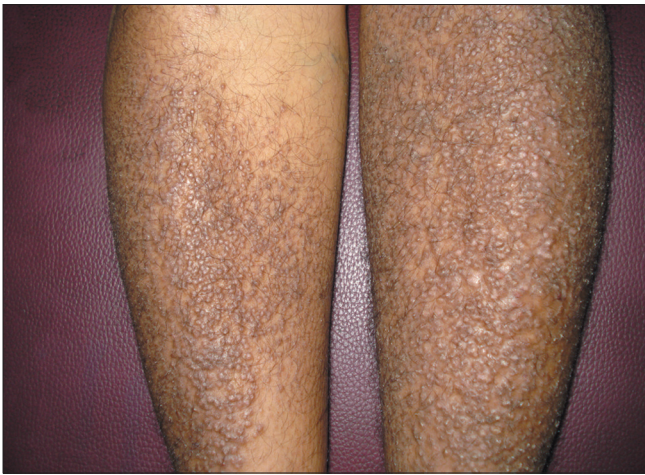
Figure 1: Hyperkeratotic papules seen distributed on the shin bilaterally