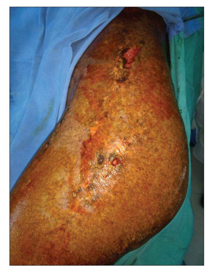
Figure 1: Ulcers due to mycosis fungoides

and base was non-indurated [Figure 1]. Though the ulcer had characteristics of healing ulcer, however, the depth and size of the ulcer were more, which rendered it difficult to heal spontaneously. Patient was then referred to plastic surgery for treatment of nonhealing of ulcers. After two more weeks of conservative management, the ulcer failed to heal, so we decided to do a split-thickness skin graft for the nonhealing of ulcers. The main concern, however, was rejection of the graft because of increased immune reaction secondary to increased number of pathologic T lymphocytes.