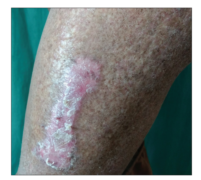
Figure 4: Donor site after 3 weeks

Studies have shown that suppressing the donor skin antigenicity with photodynamic therapy can prolong the allograft survival. Similar immunosuppression is seen with UV-B therapy, which decreases cytotoxic T-lymphocyte activity with subsequent decrease in delayed type hypersensitivity and increased graft uptake. In addition to that, NBUVB may suppress the neoplastic proliferation of clonal T cells and serve as an up-regulator