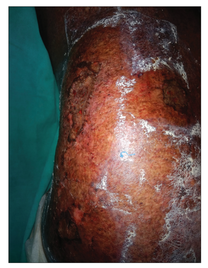
Figure 2: Postoperative (after split-thickness skin grafting)