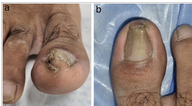
Figure 1: (a,b) Thickened nail plate distally showing a plicated nail morphology with a fissure in the lateral nail fold. Dorsally, the nail plate shows a broad central zone of leukonychia with a distal increase in transverse curvature