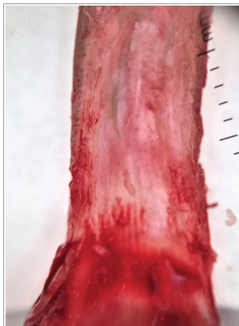
Figure 3: Intraoperative onychoscopy revealed regularly arranged hyperbolic crypts with few filiform projections, seen in the proximal part of the ventral aspect of the nail plate (DermLite DL4 × 10 polarized)

Direct microscopy and fungal culture from distal nail plate clippings were negative for any fungal elements. Digital X-ray revealed a thickened nail plate, with a normal underlying phalanx, while MRI revealed mild thickening of the nail bed, subungual swelling, and absence of any nail plate deformity. Due to a suspected matrix growth, surgical management was planned with central hemiavulsion of the nail plate rather than lateral partial nail avulsion. This revealed a tumor with papillary projections underneath the affected part of the nail plate. Intraoperative onychoscopy revealed regularly arranged hyperbolic crypts with a few filiform projections in the proximal part of the ventral aspect of the nail plate [Figure 3]. Histopathologic examination of the removed matrix growth revealed both epithelial and stromal components with epithelial strands originating from the nail matrix, penetrating vertically into the stroma. Features were suggestive of an onychomatricoma [Figure 4]. Sagittal sections through the nail plate did not reveal epithelium-lined cavities.