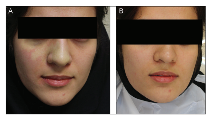
Figure 4: (A) Facial blanching immediately after inferior alveolar nerve block injection and (B) 10 minutes later