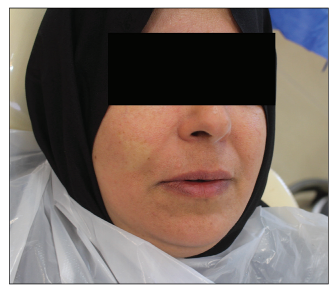
Figure 5: Partial blanching of the face subsequent to buccal infiltration for extraction of maxillary second premolar

Vasoconstrictors are not necessary for facial blanching. In two cases (1 and 3), plain mepivacaine had been used.