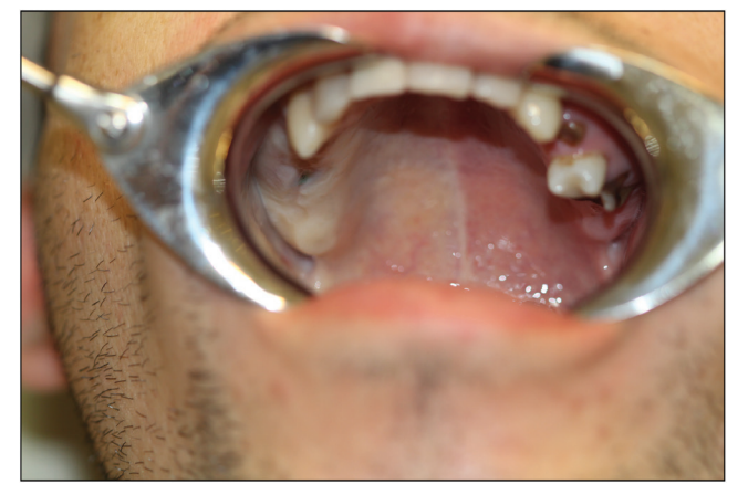
Figure 2: Facial blanching and palatal whitening after inferior alveolar nerve block injection

and the patient felt burning and itching sensation on the face [Figure 3].