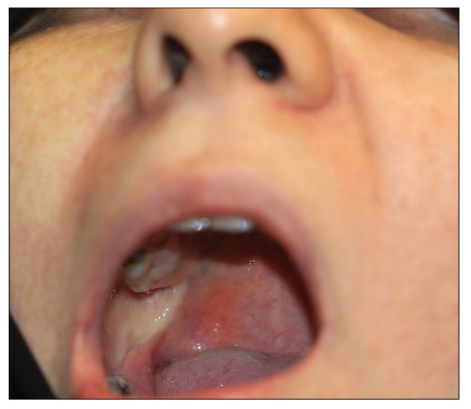
Figure 1: Facial, buccal, and palatal blanching after Gow-Gates injection

from greater palatine canal approach was used for obtaining profound anesthesia. Facial and palatal blanching occurred immediately after the injection,