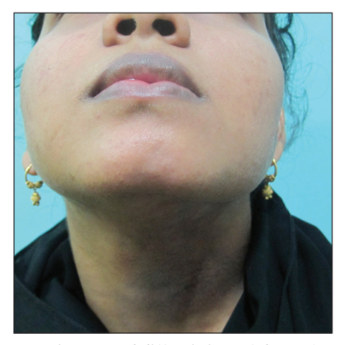
Figure 4: Persistence of filler injected for subcutaneous atrophy in morphea at 9 months post-treatment