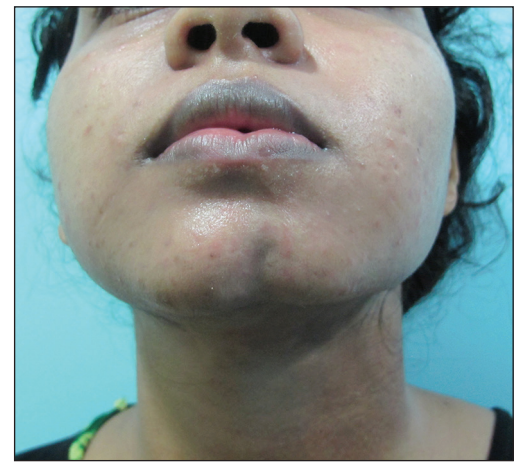
Figure 1: Circumscribed morphea with chin contour defect

The non-animal stabilised hyaluronic acid fillers (Perlane<sup>R</sup>- Q Med) were considered due to their safety, no requirement for pre-testing, large particle size, lifting and volume restoring capacity, longevity due to minimal cross-linking and ability to reverse injection with hyaluronidase when required if result is undesirable. Perlane<sup>R</sup> has a large particle size of 1000 microns and is approved for deep dermal and subcutaneous injections. The patient showed satisfactory correction of volume deformity with HA filler which was safe and effective and showed persistence for 9 months of follow-up with no signs of filler degradation. Reports claim expansion of the use of hyaluronic acid fillers to include scar atrophy, as persistence of a desired cosmetic appearance of volume restoration and appearance of the scar with sustained satisfaction 24 months after hyaluronic acid treatment, without the need for repeat injection.<sup>[8]</sup> Thraeja and Richards et al. report successful correction of en coup de sabre and linear morphea with HA fillers,<sup>[5,8]</sup>