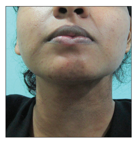
Figure 3: Circumscribed morphea-1 week after HA filler

Autologous dermal fat grafts resulted in the treated areas at level with the adjacent skin within 3 months. Followup for a period of 12 months showed a perfectly level and stable graft with no further resorption.<sup>[9]</sup> Potential complications of fillers include bruising, lumpiness, infections and vascular occlusion.and were not seen in this patient. Faster degradation of filler in morphea was one of our greatest concerns which were not seen in our patient due to inactive nature of the disease. The volume correction was maintained by the patient till follow-up at 9 months. Longer follow-up is needed to evaluate persistence in this patient beyond 9 months and more studies with permanent fillers are needed. The HA fillers are a good minimally invasive temporary therapeutic option for volume defect correction in focal circumscribed morphea involving the face.