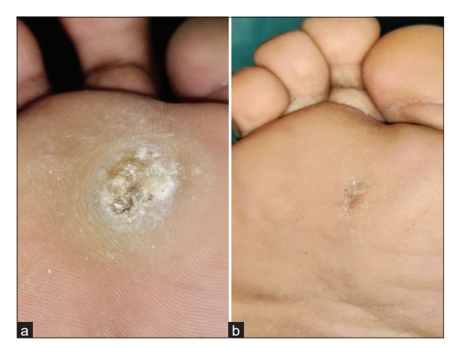
Figure 2: (a) Single-skin-colored plaque with a verrucous surface present on the sole of the right foot. (b) Complete clearance after 8 weeks of bleomycin treatment.