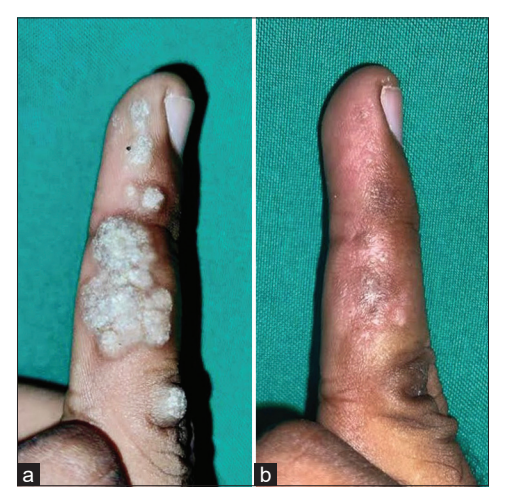
Figure 3: (a) Single plaque with a verrucous surface present over the middle finger of the right hand. (b) Complete clearance after 12 weeks of bleomycin treatment.

85 palmoplantar and periungual warts with intralesional bleomycin (1 mg/mL). After receiving one or two intralesional injections of bleomycin during 12 weeks, they observed a total resolution of 82 (96.5%) warts.11 Unni and Tapare conducted an evaluator-blinded and placebo-controlled study on intralesional bleomycin in the treatment of common warts, in which 93.10% of patients showed complete resolution.1