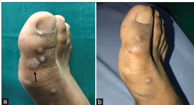
Figure 1: (a) A 35-year-old male patient presenting with verruca vulgaris on the dorsal aspect of right great toe. The target lesion is indicated by the black arrow. On the first session (week 0) of treatment with intralesional tuberculin purified protein derivative (PPD). (b) At 6 months follow-up, the warts showed a marked response to treatment with intralesional tuberculin PPD.

(median 6 weeks) in the Vitamin D 3 group. Data evaluation showed that the time difference in the resolution of warts in the two groups was statistically insignificant ( P = 0.552 ). The patient data showed that there was no recurrence of cutaneous warts after 3 months of intralesional therapy with tuberculin PPD or Vitamin D 3 . However, out of 40 patients in Group A and 36 patients in Group B who had achieved complete response at the end of treatment, 7 patients (17.5%) in Group A and 4 patients (11.1%) in Group B reported recurrence of warts at 6 months follow-up.