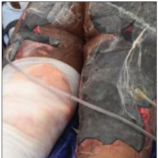
Figure 4: Negative pressure wound therapy (KCI Vacuum Assisted Closure®) seal of the lower extremities. The V.A.C. dressings were placed following the first tissue debridement procedure