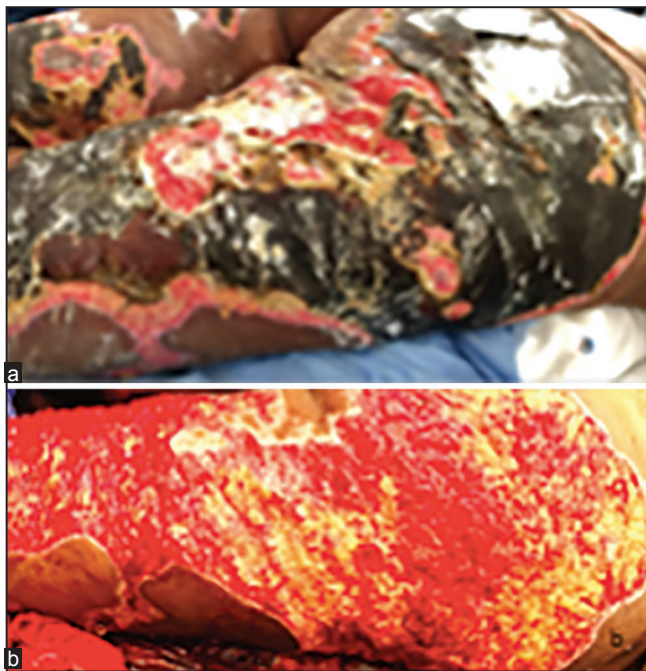
Figure 3: (a) Full-thickness excisional debridement of the posterolateral lower extremities. Day 29 of hospital admission, the patient underwent excisional debridement, prompted by the progression of her lesions to full-thickness necrosis and complicated by a superimposed bacterial infection, identified by purulent discharge from the wounds – pre-debridement. (b) full-thickness excisional debridement of the posterolateral lower extremities. Day 29 of hospital admission, the patient underwent excisional debridement, prompted by the progression of her lesions to full-thickness necrosis and complicated by a superimposed bacterial infection, identified by purulent discharge from the wounds – post-debridement