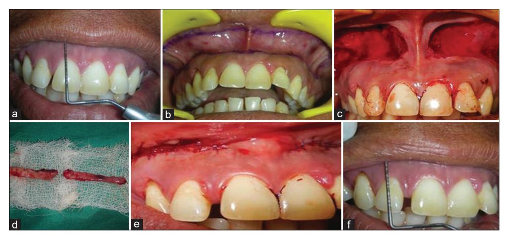
Figure 1: Surgical procedure for Group A. (a) Preoperative measurements. (b) Outline marked. (c) Dissection of mucosa. (d) Excised mucosa. (e) Sutures placed. (f) Postoperative measurements.