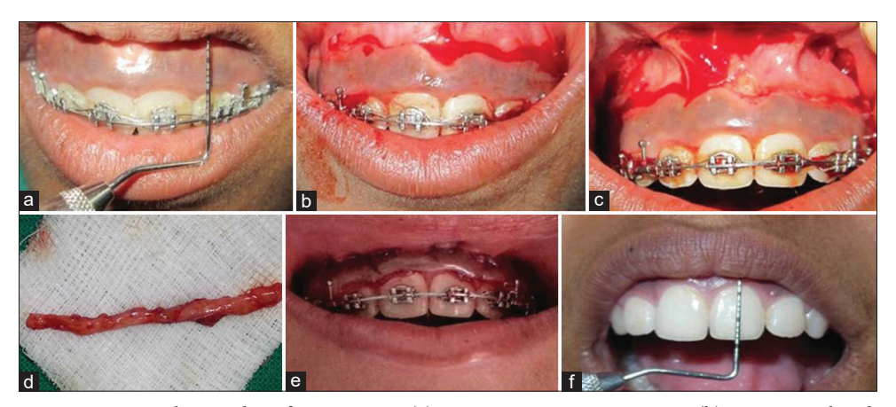
Figure 2: Surgical procedure for Group B. (a) Preoperative measurements. (b) Incisions placed. (c) Dissection of mucosa. (d) Excised mucosa. (e) Sutures placed. (f) Postoperative measurements.