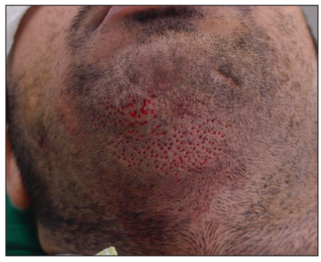
Figure 7: Beard area after FUE

anesthesia remained the same as used during test patch 10 months earlier. Follicular units having more than two hair follicles per graft were selected from the scalp, while the beard hair grafts had mostly single hair follicles. A total of 900 hair follicular units equaling approximately 1,800 hairs at a density of 18 FU/cm<sup>2</sup> were transplanted, inclusive of two sessions. After transplant, minoxidil 5% application, twice daily,