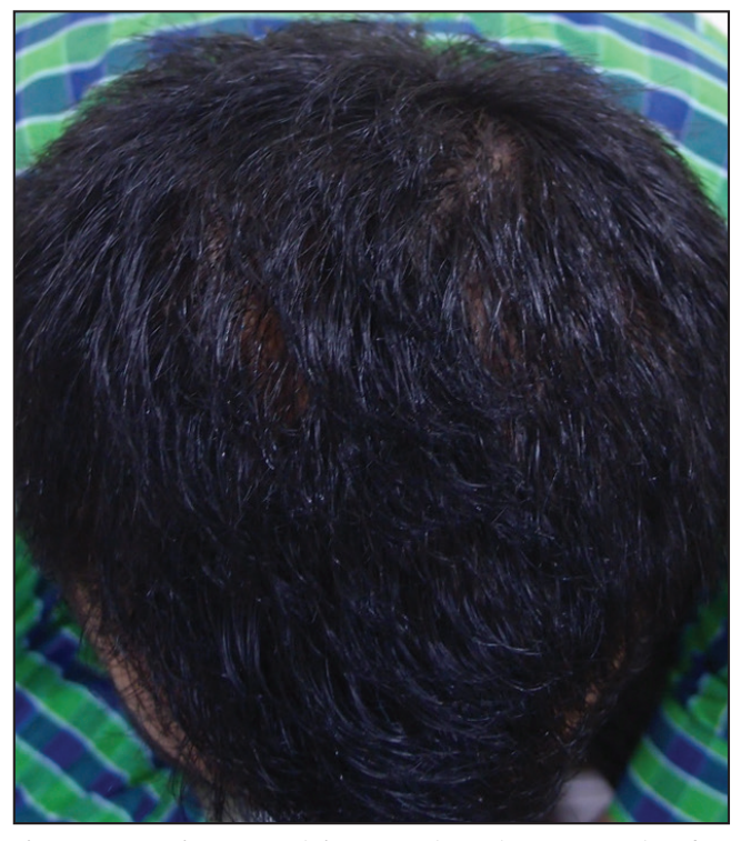
Figures 11: Hair regrowth in scarred patches 10 months after second post 2nd session of transplant. The grafts from beard as well as scalp areas showing viable growth in scarred tissue providing reasonable coverage in cicatricial areas

because of the involvement of the cicatricial patches in the safe donor area on the scalp, as linear incision in such scarred donor area would have been problematic.<sup>[4]</sup> In addition, due to extensive involvement in frontal, temporal, vertex, and parietal areas, there was a lack of adequate donor grafts from the scalp and hence, after harvesting from a safe donor area, additional required grafts were harvested from the beard area using the FUE method. FUE method gives the added advantage of using body hair for transplant when donor area in the scalp is inadequate.<sup>[5]</sup>