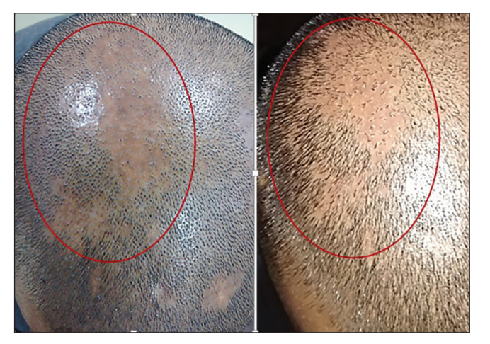
Figure 5: Test patch showing hair growth of the harvested follicles after 3 months

this method. After the procedure, 80% of transplanted follicles showed optimum regrowth in the test patch [Figure 5].