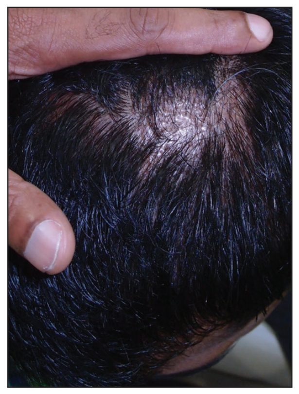
Figures 9: Hair regrowth in scarred patches 10 months after second session of transplant. The grafts from the beard as well as scalp areas showing viable growth in scarred tissue providing reasonable coverage in cicatricial areas

was advised. Ten months after procedure, 80% of the transplanted grafts from the scalp as well as from the beard area survived and showed optimal growth, providing a reasonable cover in the alopecia patches [Figures 8-11]. Compared to the scalp hair follicles, the transplanted follicles from the beard area showed faster hair growth.