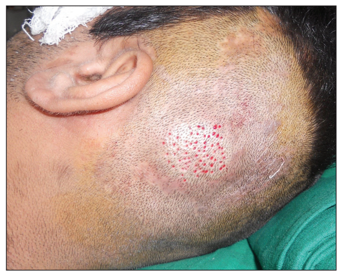
Figure 3: follicles harvested from unaffected occipital area of scalp

The PRP was made with using a two-step centrifugation process on benchtop centrifuge Remi model R4 at room temperature. The anticoagulant used was acid citrate A anticoagulant (ACD-A). 8.5 mL of whole blood was mixed with 1.5 mL of ACD-A anticoagulant to make 10 mL of anticoagulated whole blood per sterile centrifuge tube. Two-step centrifugation with a 15 min duration of each step, first at 200 g and second at 310 g forces were used for making PRP. A total of 5 mL of PRP from 50 mL of whole blood was made by