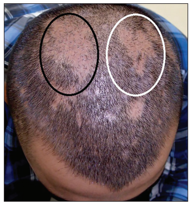
Figure 8: Month after second session scarring alopecia patches circled in black have follicles harvested from the scalp, while white circles showing follicles harvested from the beard area

FUE method was preferred in this case for harvesting