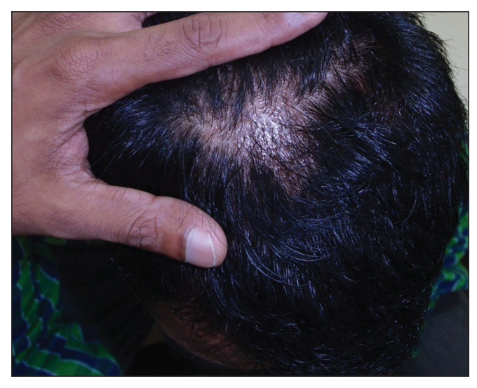
Figures 10: Hair regrowth in scarred patches 10 months after second post 2nd session of transplant. The grafts from beard as well as scalp areas showing viable growth in scarred tissue providing reasonable coverage in cicatricial areas