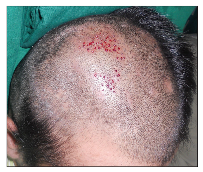
Figure 4: Test patch with 50 follicles harvested from scalp

A total number of 850 grafts were harvested for a second session, out of which 500 were harvested from occipital, parietal, and temporal areas and remaining 350 grafts were harvested from the beard [Figures 6 and 7]. Methodology, punch size, and