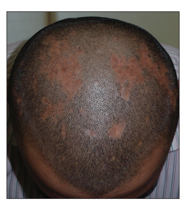
Figure 1: Case of lichen planopilaris showing multiple irregular well-defined atrophic patches of scarring alopecia involving the frontal, temporal, parietal, vertex as well as occipital areas