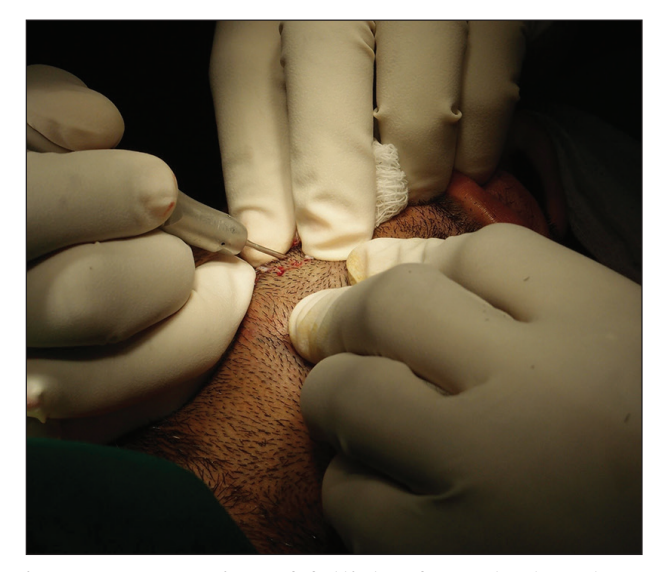
Figure 6: Harvesting of follicles from the beard area (submandibular region)