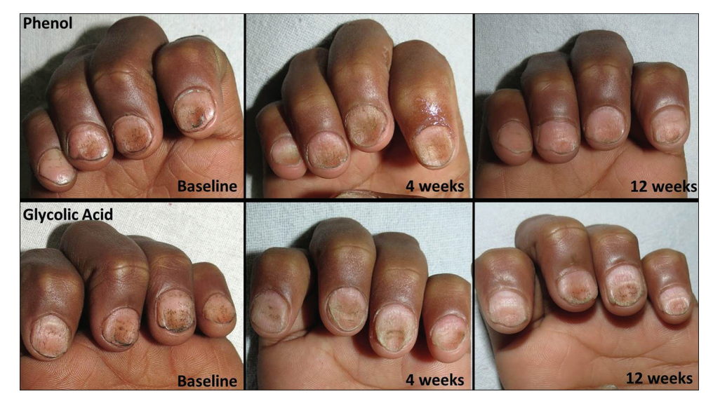
Figure 4: Sequential images of another patient with trachyonychia showing the modest improvement. The upper panel represents right side treated with phenol combination peel and the lower panel represents the left side treated with glycolic acid peel