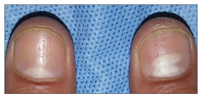
Figure 5: Leukonychia in a patient of nail pitting developing only on the right side, probably due to prolonged contact with glycolic acid peel