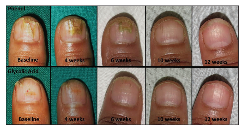
Figure 3: Sequential images of a patient with nail lichen planus demonstrating marked improvement in overall texture, pigmentation, ridging and splitting of nails. The upper panel represents right side treated with phenol combination peel, and the lower panel represents the left side treated with glycolic acid peel

The medium depth peels were well tolerated with almost no side effects; the only side effect being the development of leukonychia in 2 patients on glycolic acid peels [Figure 5]. On thorough questioning, it was found that these two patients were not complying with the instruction of washing off the peel after 20 min. This error was corrected and thereafter this side effect did not recur. The leukonychia was self-limiting and did not warrant any discontinuation of the peels. No such effect was observed with phenol peels.