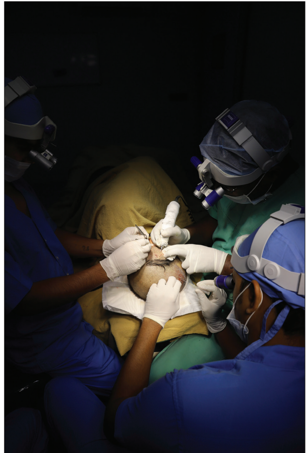
Figure 2: Graft scoring, extraction, and placement being performed in the patient

Patients with BASP scales M1, M2, C1, V1, and F1 were recorded as “mild,” and patients with BASP scales M3,