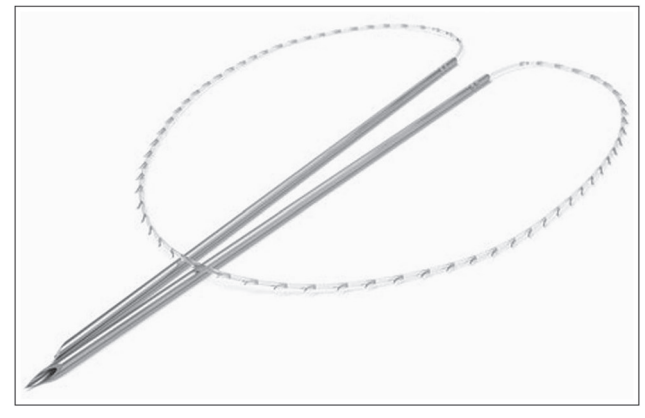
Figure 1: The implanted Aptos Light Lift Thread 2G suspension thread with monodirectional barbs, made by a copolymer of 70% poli-L-lactic acid (PLLA) and 30% poli-caprolactone (PCL)

Once the thread was inserted into this V-shaped pattern, the tissues were gently spread along its length and fixed by the monodirectional barbs in the planned position, to