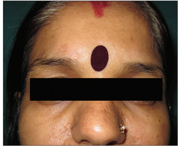
Figure 2: Varicella scars; 3 months post-treatment