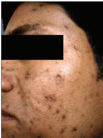
Figure 3: Varicella scars; pre-treatment