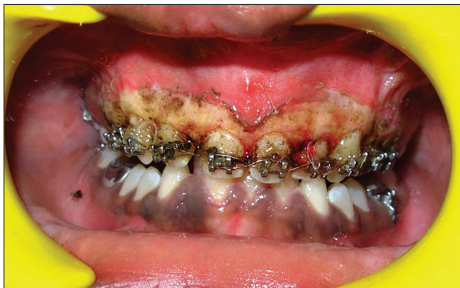
Figure 4: Immediate photograph after crown lengthening, gingivoplasty and depigmentation

3 mm constitutes for 1 mm supracrestal connective tissue attachment, 1 mm junctional epithelium and 1 mm for gingival sulcus on an average. This allows for adequate biologic width even when the restoration margins are placed 0.5 mm within the gingival sulcus. [4]