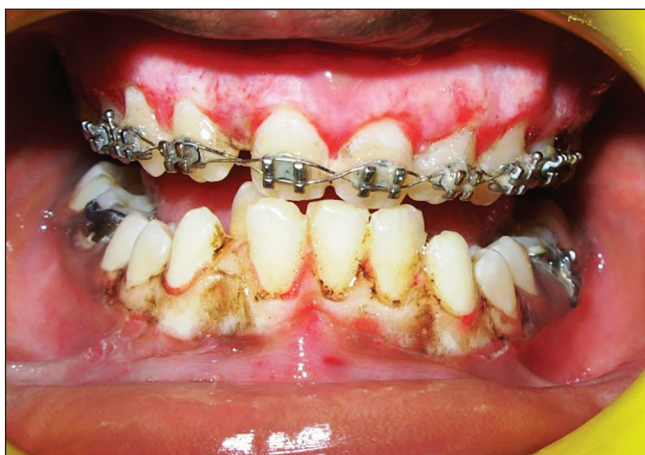
Figure 8: Immediate post-operative photograph after depigmentation in lower arch