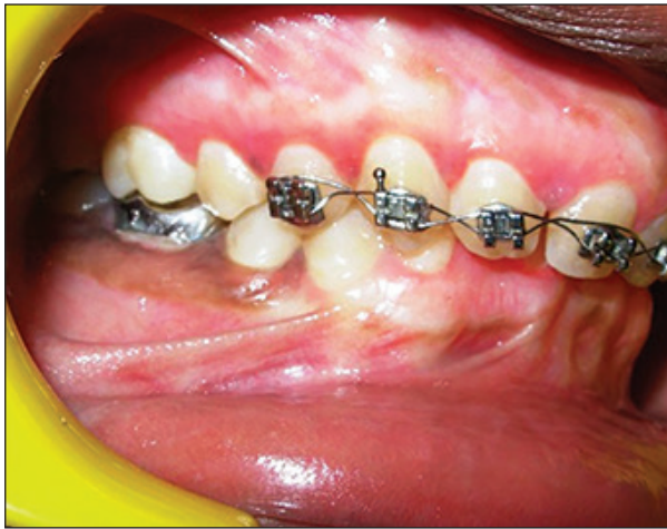
Figure 10: Healing after 2 weeks (left buccal view)