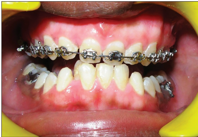
Figure 12: Post-operative photograph after 3 months