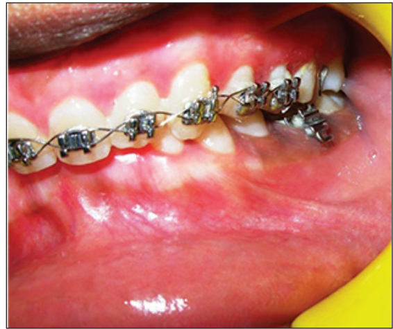
Figure 11: Healing after 2 weeks (right buccal view)