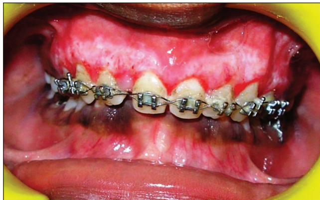
Figure 5: Healing after 1 week