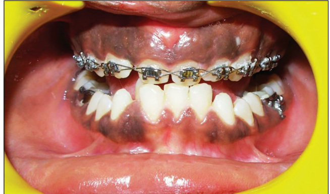
Figure 1: Pre-operative intraoral clinical photograph (frontal view)

The present case report describes a comprehensive interdisciplinary approach to improve smile line