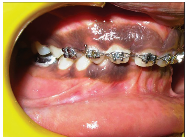
Figure 3: Pre-operative intraoral clinical photograph (right buccal view)