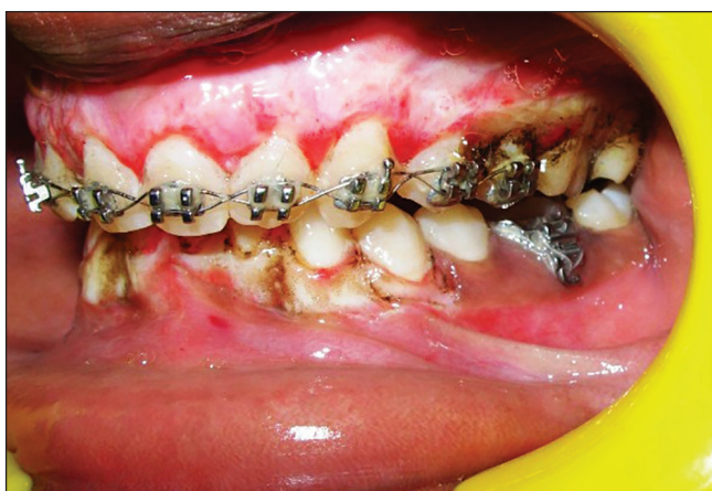
Figure 6: Immediate post-operative photograph after same procedures on left upper posterior teeth