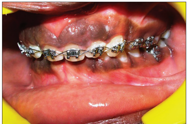
Figure 2: Pre-operative intraoral clinical photograph (left buccal view)