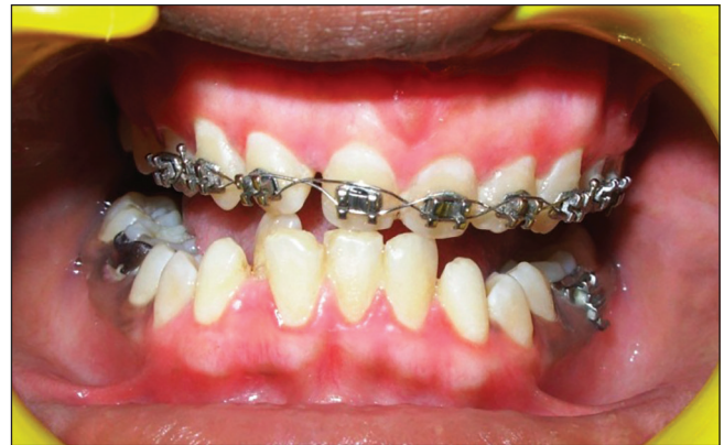
Figure 13: Post-operative photograph after 4 months

Selection of a technique for depigmentation of the gingiva should be based on clinical experience, patient's affordability and individual preferences. Although scalpel surgical technique for depigmentation is highly recommended being, cost effective with a faster healing period, its limitations include bleeding during the procedure and pain and discomfort after the procedure. Semiconductor diode laser 800 to 980-nm wavelength is highly absorbed by hemoglobin and other pigments as compared to other lasers. [5] Electrosurgery is a viable alternative as it is cost effective as compared to a laser. Regular maintenance visits, patient co-operation and motivation are important for improved success of interdisciplinary procedures to maintain an aesthetic smile health.