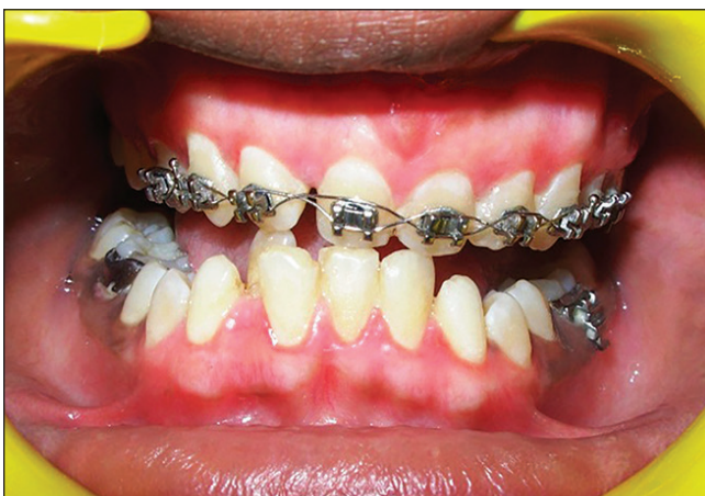
Figure 9: Healing after 2 weeks (frontal view)