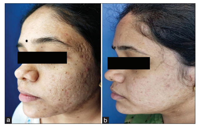
Figure 2: Improvement in the acne scars from (a) Grade 4 to (b) Grade 2 during follow-up (1 month after the last session).