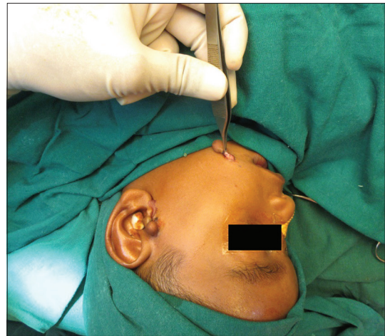
Figure 2: Excision of accessory auricle, cartilage remnant seen in the stalk of the lesion