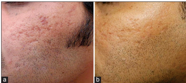
Figure 3: (a) Grade 3 acne scars, (b) Improvement in acne scars from Grade 3 to Grade 2 after treatment