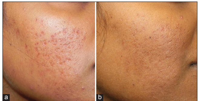
Figure 2: (a) Grade 3 acne scars, (b) Improvement in acne scars from Grade 3 to Grade 1 after treatment

The treatment was generally well tolerated. All patients underwent treatment-related pain. All patients had reported mild erythema for two days, two patients had oedema for more than three days, five patients reported post inflammatory hyperpigmentation and two patients had track marks of the device probe [Figure 5]. Social activity could commence as early as one day after treatment.