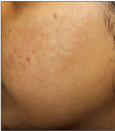
Figure 5: Adverse effect—track marks of the device probe