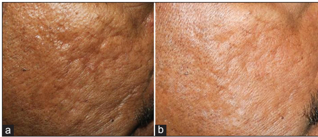
Figure 1: (a) Grade 4 acne scars, (b) Improvement in acne scars from Grade 4 to Grade 2 after treatment

Estimation of improvement with Goodman and Baron’s Global qualitative Acne Scarring System was done. Out of 31 patients who completed the treatment, 14 patients had Grade 4, 17 patients had Grade 3 before treatment. The physician’s assessment of response to treatment based on Goodman and Baron Qualitative scar grading system is summarised in Table 3. In patients with Grade 4 scars, 12 patients (85.71%) showed improvement by 2 grades, i.e. their scars improved from Grade 4 to Grade 2 of Goodman and Baron scale [Figure 1a and b]. Two patients (14.28%) with Grade 4 scars showed improvement by 1 grade with scars being obvious at social distances of 50 cm or greater. In 17 patients with Grade 3 scars,