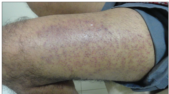
Figure 4: Extraction sites over thigh healed 2 days after extraction