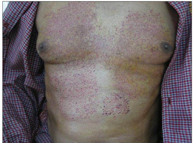
Figure 2: Chest and abdomen immediately after extraction