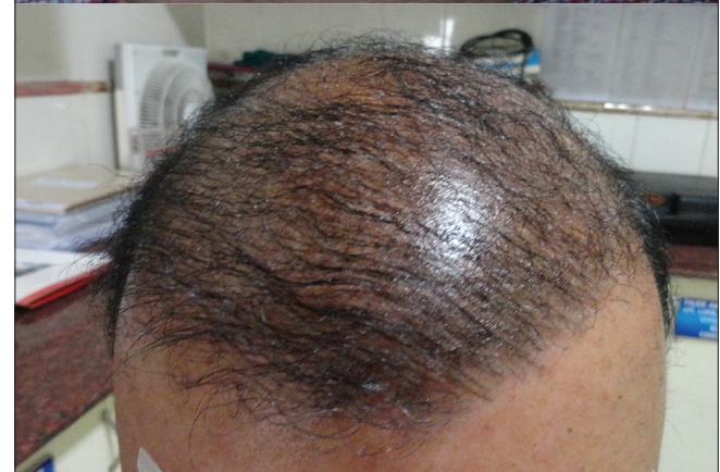
Figure 6: Satisfactory result after 8 months