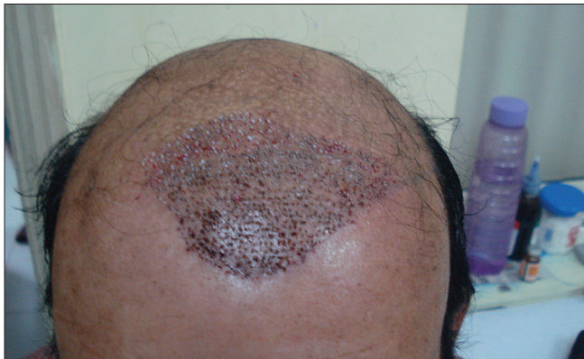
Figure 1: Immediate postoperative photograph of test grafting with body hair in frontal area with 400 grafts

Body hair transplantation is a relatively new surgical technique used for hair restoration. The scientific basis for the procedure is provided by the concept of recipient influence, which suggests that dermis in the recipient area may exert influence on the growth pattern of transplanted hair and hence when body hair is transplanted on to scalp, it would grow longer, thicker. [2] The rationale has been confirmed in a few published reports. [3-5] Further, since the procedure is performed by extraction method which produces very small scars, and body is a cosmetically less significant area, body hairs can help to provide an alternative source of donor hair in selected patients. This is particularly so in Indian patients, who do not expose body in public as sunbathing so common in the west, is not popular in Indians. Our report represents additional proof that body hair indeed can be a valuable alternative source in patients who lack