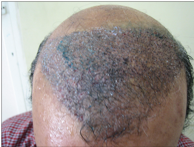
Figure 5: Frontal area immediately after implantation