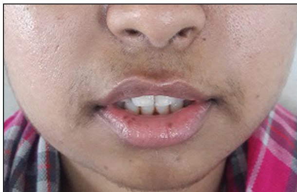
Figure 5: Focal pigmentation of lower lip (before treatment)

Dark lips are a very common condition among Asians, yet difficult to treat. There is dearth of data regarding management of lip pigmentation. Results with topical treatment are often unsatisfactory. Pigmentary lasers such as Q-switched Ruby laser, Q-switched Alexandrite laser, and Q-switched Nd:YAG laser have been used for treating pigmentary lesions of oral mucosa.