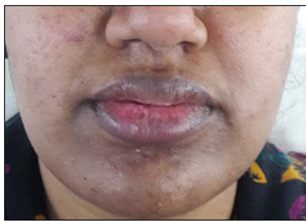
Figure 3: Diffuse pigmentation of lips (before treatment)