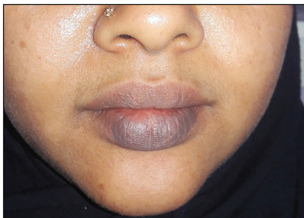
Figure 1: Diffuse pigmentation of lower lip