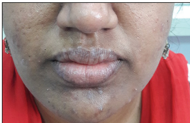
Figure 4: Reduction in pigmentation of lips after five sessions of laser