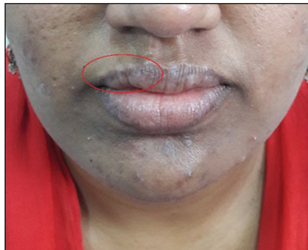
Figure 7: Hypopigmentation in the adjacent area following laser treatment of upper lip

Li et al. [10] in their study showed the efficacy of Q-switched alexandrite laser in 43 patients with facial and labial lentiginos associated with Peutz–Jegher's syndrome. Improvement in pigmentation was seen with 3 sessions, 55.8% of the patients had excellent results and 44.2% showed good results. No complications were seen.