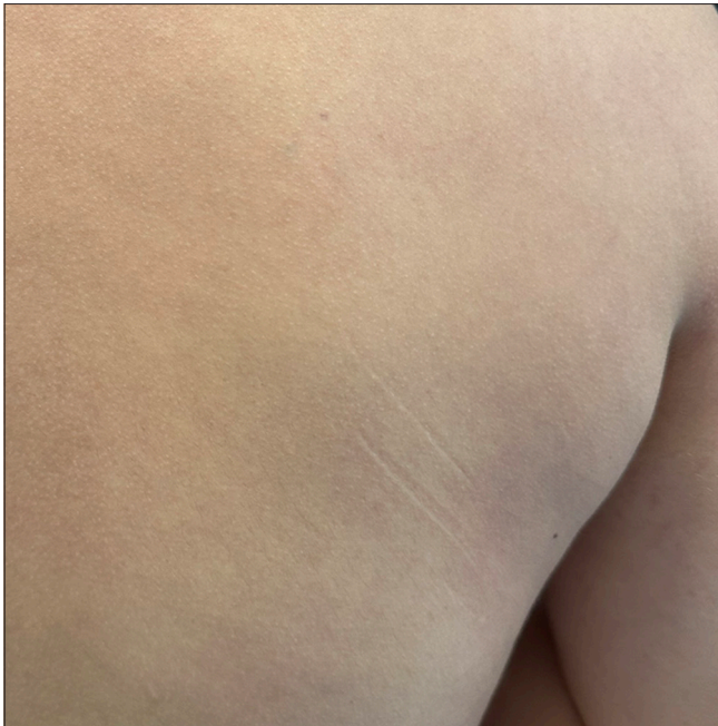
Figure 2: Clinical image after treatment: Complete resolution of the glomuvenous malformation on the right scapular region, after 5 sessions of 1064-nm neodymium-doped yttrium aluminum garnet laser treatment.

ablation. 5 The laser parameters and number of treatment sessions depend on the lesion type, body site, patient's age, and laser surgeon's experience. 5 The reported parameters include spot sizes of 3–10 mm, intervals of 10–50 ms, and fluences of 50–240 J/cm 2 . Unlike shorter-wavelength lasers, small upward adjustments influence this laser can result in ulceration,