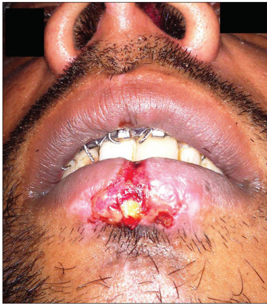
Figure 1: Avulsive wound over the lower lip