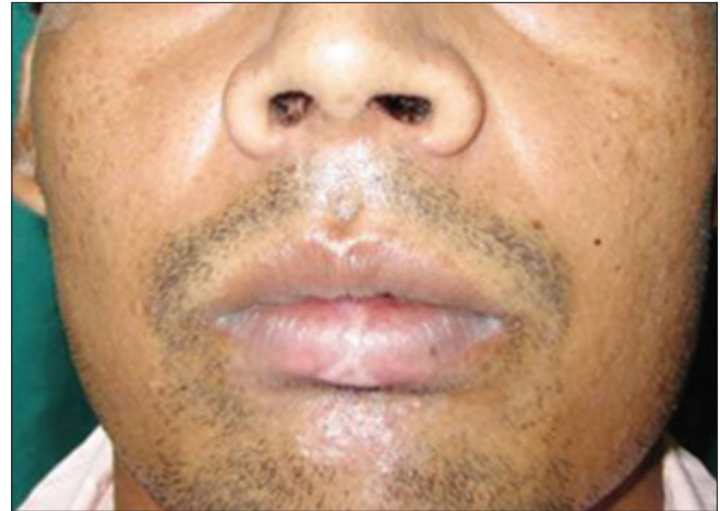
Figure 4: Two weeks follow up

PRF-treated site showed hastened healing with early wound contracture. In the subsequent visits, the color of the reconstructed region was comparable to the adjacent uninjured tissue. The defect in the vermilion border and the white roll was inconspicuous [Figure 5].