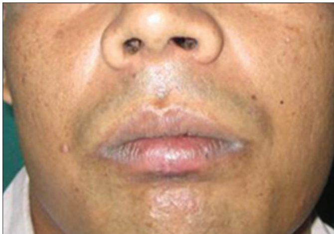
Figure 5: Six weeks follow up