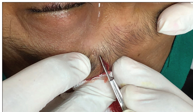
Figure 1: Illustration of surgical technique.

A total of 12 patients were enrolled in our study, among which 8 (66%) were males and 4 (33%) were females. Age at