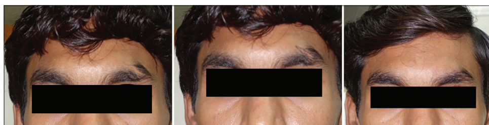
Figure 2: Case 1.