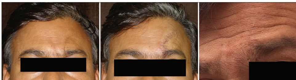
Figure 4: Case 3.