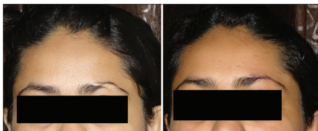
Figure 3: Case 2.

presentation ranged from 19 to 44 years with a mean age of 29.5 years [Table 2].