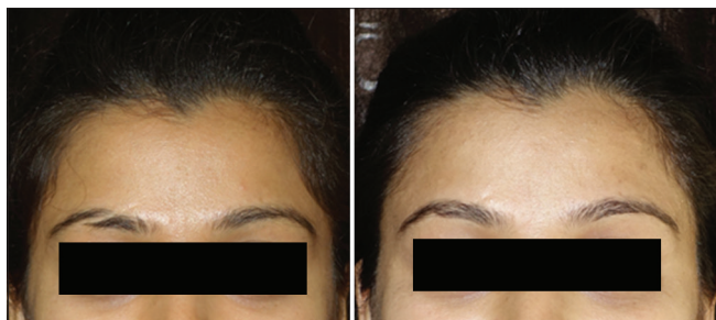
Figure 5: Case 4.