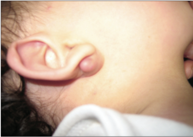
Figure 1: Auricular mass (Note the absence of inflammatory sign)