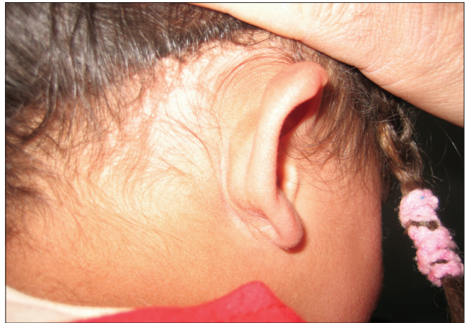
Figure 3: Post-treatment photographs showed a good aesthetic result