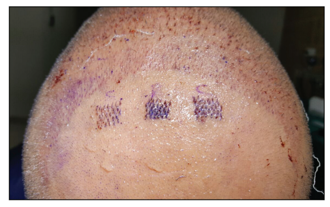
Figure 4: Grafts after implantation as scalp, beard, and chest (left to right)

at 2 months was 40%, 30%, and 53.7% for scalp, beard, and chest, respectively. Figure 7 shows the survival of different sites of all patients at the end of 2 months. The mean survival rate at 3 and 6 months [Figures 8 and 9] for scalp, beard, and chest was 62%, 73.3%, and 57.3% and 80%, 86.6%, and 67.3%, respectively. Final evaluation was