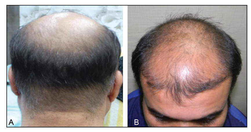
Figure 1: Low-donor reserve (A) versus high-recipient requirement (B)

Gupta, et al.: Anagen effluvium and survival rates of hair in HRP