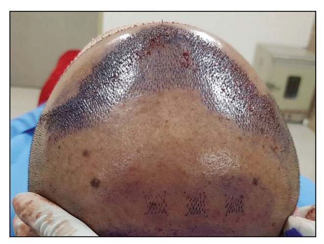
Figure 3: Thirty slits in 1 cm<sup>2</sup> of size 0.9 mm in brick pattern