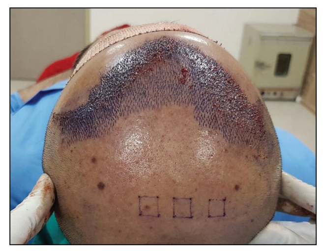
Figure 2: Marked blocks as scalp, beard, and chest (left to right) on mid-frontal area