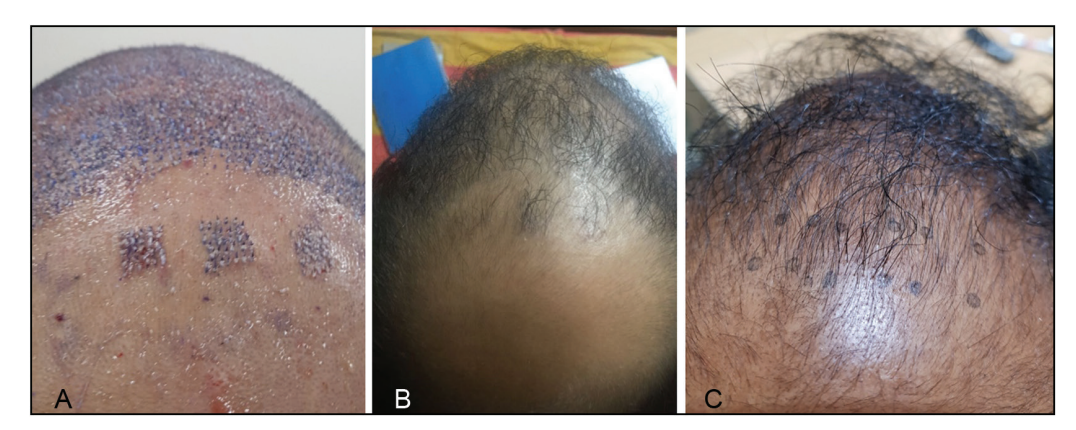
Figure 9: Immediately after implantation (A), after 3 months of transplant (B), after 6 months of transplant (C) with marker pen to demarcate the areas (scalp, beard, and chest: left to right)