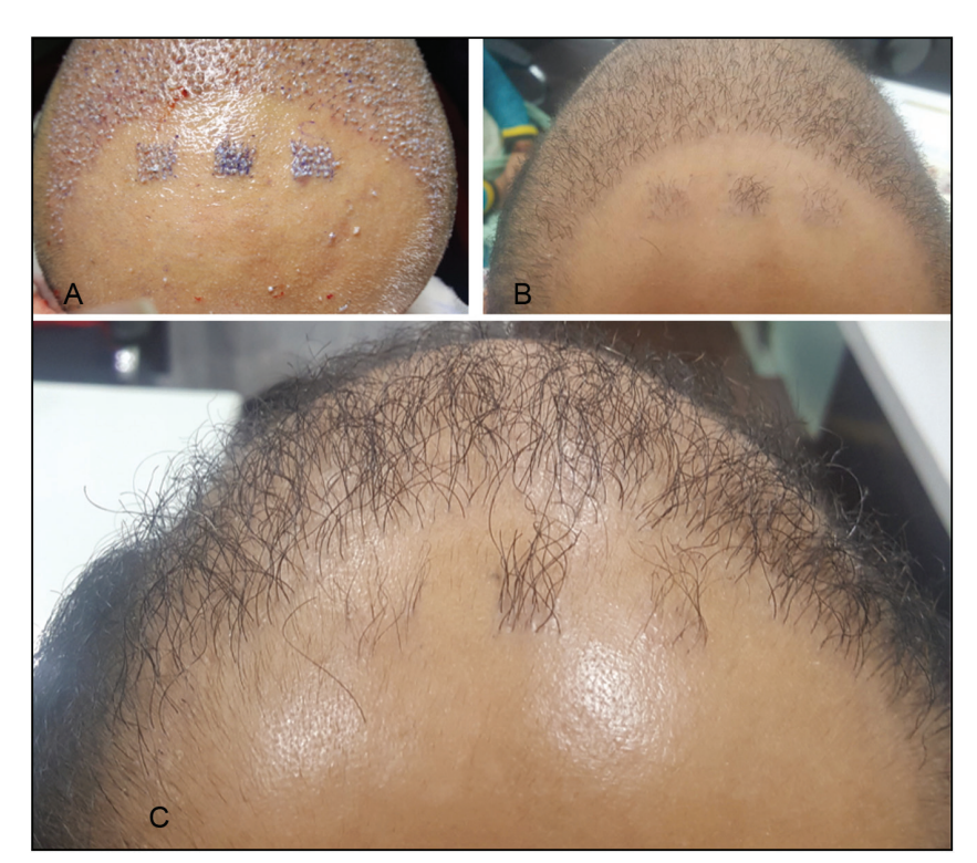
Figure 8: Immediately after implantation (A), after 2 weeks of transplant (B), after 3 months of transplant (C) (scalp, beard, and chest: left to right)

Few studies have objectively measured the survival rate. Umar S^{[4,12]} reported overall graft survival of 95% for scalp and 75–8% for body hair. We almost found the