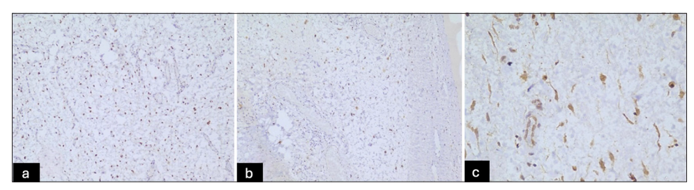
Figure 3: (a-c) On immunohistochemistry, the tumor cells were positive for (a) estrogen receptor, 10X (b) progesterone receptor, 10X and (c) desmin, 20X.

in clinical outcomes and treatment approaches. Superficial AM is mostly seen in middle-aged patients, and it can appear anywhere on the trunk and extremities. However, AAMs are specific to the perineal and pelvic regions. Deep AMs do not have a capsule and, have low mitotic activity, have a higher recurrence rate (~36-72%) after excision.<sup>2</sup> These can be identified on computed tomography scans due to their distinct margin and lower density than muscle. On magnetic resonance imaging (MRI), they present as having a high signal intensity on T2-weighted images. This is likely due to their loose myxoid matrix and high water content. In addition, the myxoid tissue in the AM displays a laminated pattern with alternating hyper- and hypointense linear areas, which is caused by the presence of collagen fibrils.<sup>4,5</sup> However, our patient did not undergo radiological investigation as the initial presentation resembled that of a benign mass.