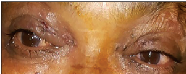
Figure 3: Immediate post-op photograph showing cosmetic improvement

Other causes of ptosis were ruled out. Routine blood tests were within normal limits, and the patient tested negative for Hepatitis B and HIV. The patient was taken up for surgical excision of the comedones under local anaesthesia using 2% lignocaine. Redundant skin was excised and sutures using 6-0 Vicryl® were placed [Figures 3 and 4]. Histopathology report showed cysts lined by stratified squamous epithelium filled with lamellated keratin, suggestive of epithelial inclusion cyst. Two weeks after surgery, the patient showed improvement in lid position. The patient was advised to wear sun protective goggles when outdoors.