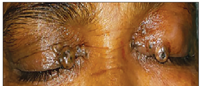
Figure 2: Before surgery

The characteristic solar elastosis refers to damage to dermal elastic tissue from chronic exposure to UVA and UVB radiation. It is most often seen in the periorbital area [2] though it can be seen in other parts of the face and neck