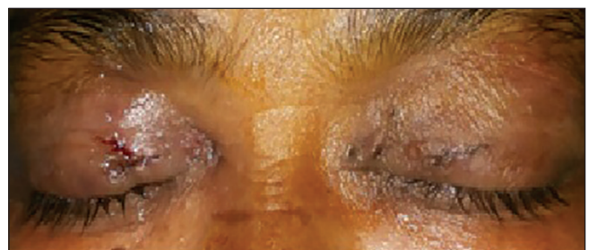
Figure 4: After surgery