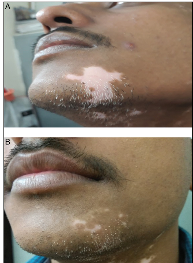
Figure 1: (A) Vitiligo patch before FUT. (B) Vitiligo patch after FUT at 20 weeks

While considering time taken for repigmentation, we found that 25%–50% and 50%–75% repigmentation was observed in 27 of 50 (54%) and 8 of 50 (16%) lesions in JT group and in 22 of 50 (44%) and 2 of 50 (4%) lesions in