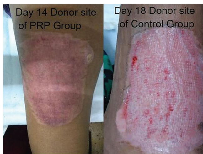
Figure 3: Donor site PRP group versus conventional group

dressing slides down spontaneously, whichever is earlier. In control group extent of donor site healing on the first dressing was >50% in 53.3% patients, whereas it is seen in 86.7% in PRP group. The incidence of scar hypertrophy of donor site was 10% in control group, whereas it was 6.7% in PRP group [Table 2 and Figure 3]. The mean platelet count in PRP group is 2.46 lakh. Platelet count was also measured in the autologous PRP of all the patients. The mean platelet count of autologous PRP was 5.65 lakh which was found to be 2.3 times the blood platelet levels.