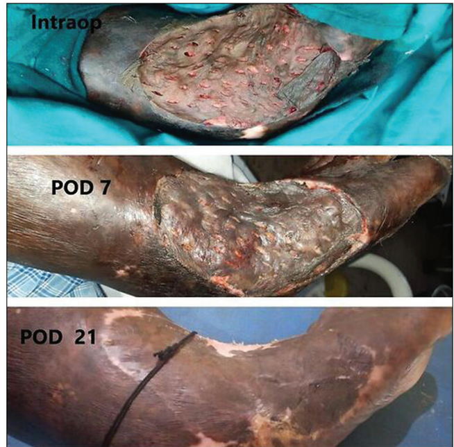
Figure 2: Recipient site graft take after PRP application at POD 21

group were upgraded to opioid analgesics between POD1 and 4. On POD1 in control group, 93.3% experienced severe pain, while 6.7% had moderate pain. In PRP group, 70% patients complained of severe pain, while 30% patients experienced moderate pain. On POD3 in control group 60% patients experienced severe pain, whereas the remaining 40% had moderate pain. In PRP group, 3.3% had severe pain rest of the 96.7% had moderate pain. On POD5 in control group, 93.3% patients experienced moderate pain, and the rest of 6.7% patients complained of mild pain. Whereas in PRP group majority of the patients, i.e., 80% of them experienced mild pain, and only 20% complained of moderate pain on POD5 [Table 3].