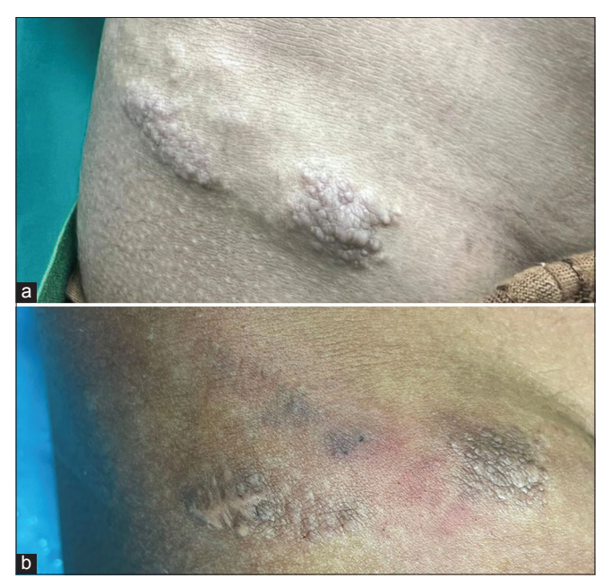
Figure 1: (a) Multiple skin-colored to erythematous papules coalescing to form plaques over the right inguinal region. (b) Patient follow-up image after the second session of embolization therapy.