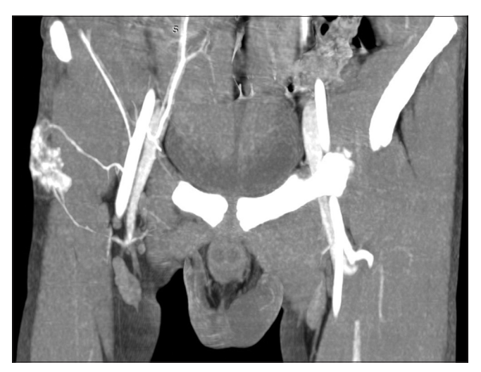
Figure 4: Contrast-enhanced computed tomography showing intensely enhancing lesion in the anterolateral aspect of the proximal thigh with arterial and venous drainage from the right circumflex femoral artery and vein.

circumscriptum can occur at any age due to architectural destruction of the normal lymphatics resulting from trauma, surgery, radiation, etc.1 Dermoscopically, lymphangiomas are characterized by two kinds of structures: First, multiple yellowcolored lacunae with pale septa and second, dark red or blue lacunae due to the inclusion of blood.1 Treatment modalities include sclerotherapy, electrofulguration, CO2 laser ablation, and cryotherapy.2