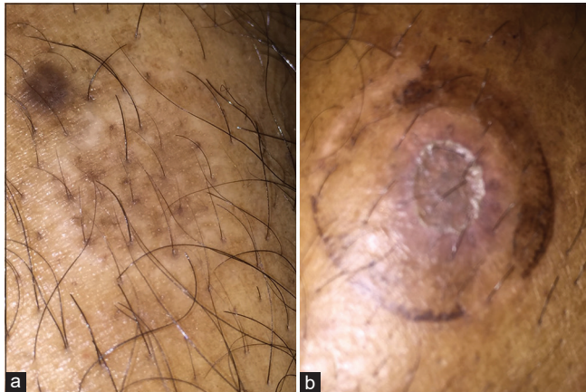
Figure 2: (a) The pigmentation of donor sites without epidermal grafting showing patchy and perifollicular pigmentation and (b) diffuse pigmentation after epidermal grafting.

from its base completely [Figure 1a-d]. The same procedure was repeated to detach the second half of the graft. During the procedure, the tape was kept dry for better adhesiveness of the tape on the graft. The tape gives strength to the delicate graft and prevents the graft from getting torn. After harvestation, the epidermis remained uncurled and unwrinkled. This graft can be resized into any size and shape. There is no problem with surface identification, in-curling, and anti-wrinkling of the graft. The graft could be handled, transferred, or