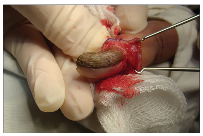
Figure 2: Intraoperative aspect before excision

OM, a condition described 21 years ago, has been reported in several countries.<sup>[3]</sup> Baran and Kint<sup>[1]</sup> first described OM and confirmed the nail matrix origin of the tumour. Other authors, however, have proposed it as a fibroproliferative hamartoma, which simulates the nail matrix histology. OM has a female: male ratio of 2.16:1;