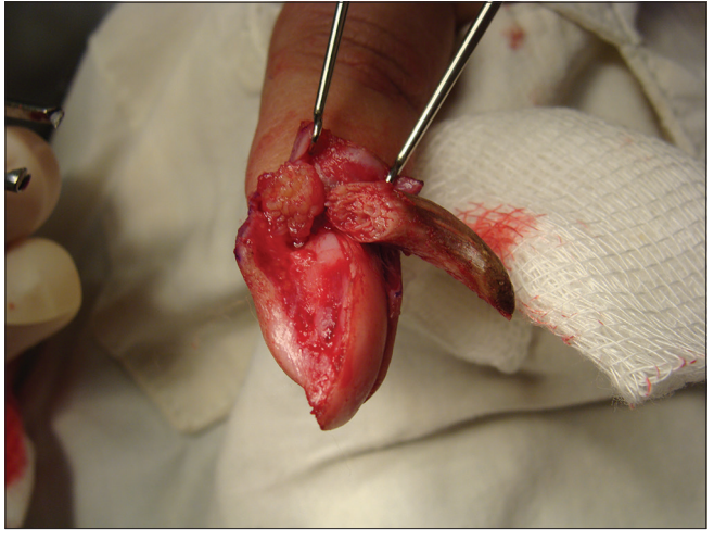
Figure 3: Filamentous, tufted material under the proximal nail