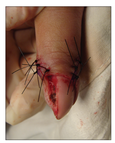
Figure 4: Immediate post-operatory