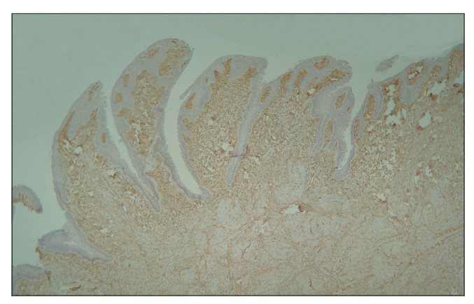
Figure 6: CD34 positive stromal cells (immunostaining, ×100)