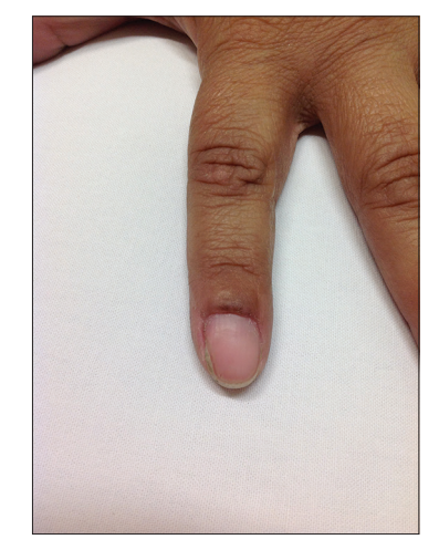
Figure 8: Five years of follow-up

In some cases, as in the present patient, the clinical presentation may be confusing, because longitudinal melanonychia may hide the yellow hue, and the proximal nail fold may be swollen at its junction with the lateral nail fold. This swelling gives the affected nail, the texture of a cutaneous horn. In some cases, this horn is completely separated from the nail plate. Histologic examination establishes the diagnosis.<sup>[3]</sup>