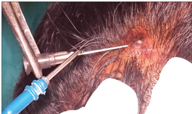
Figure 3: Intralesional radio-frequency ablation technique