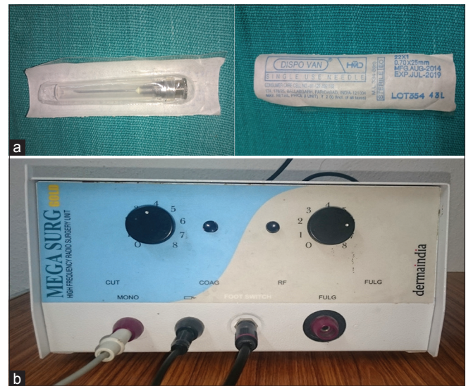
Figure 2: (a) 22-gauge sterile needle used for intralesional radio-frequency ablation and (b) radio-frequency ablation equipment