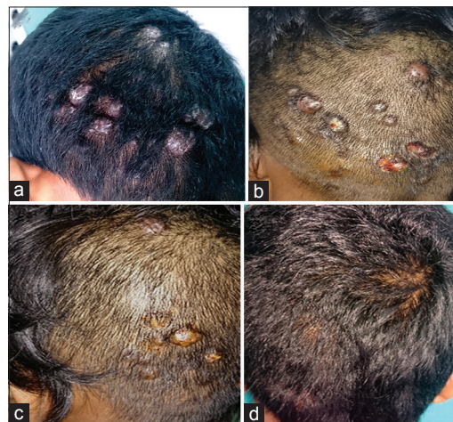
Figure 4: (a) Initial presentation of angiolymploid hyperplasia with eosinophilia, (b) at the end of the fourth session, (c) sixth session, (d) 2 weeks after the last session