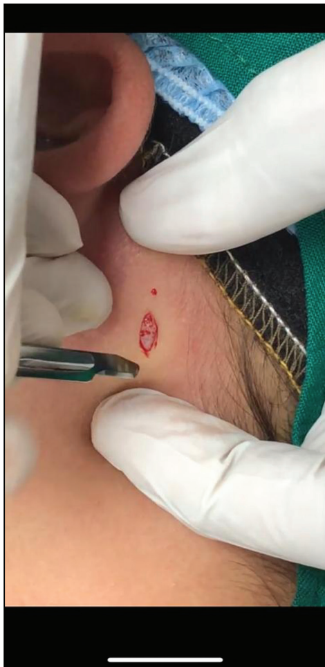
Figure 1: Showing retro-auricle donor area from where graft was harvested

A 28-year-old female presented with a complaint of depressed scar at nose piercing site. Clinical examination