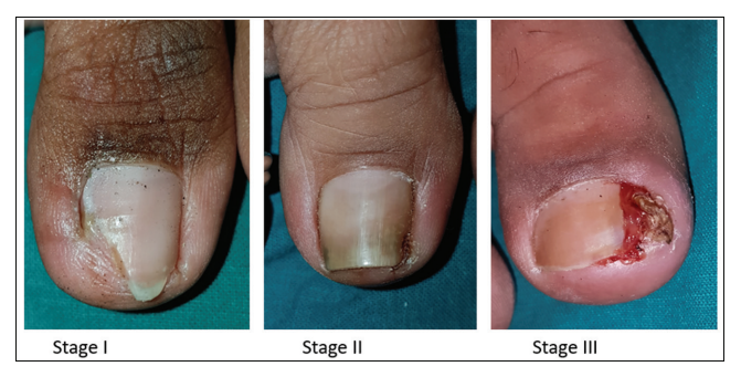
Figure 1: Stage 1—ingrown nail with mild erythema and edema of nail folds; Stage 2—acute inflammation and suppuration; Stage 3—hypertrophy of nail folds with drainage and granulation tissue

The objective of this study was to evaluate the efficacy of the three different cauterants 10% NaOH, 88% phenol, and 90% trichloroacetic acid in the management of ingrown nails and to compare the duration of post-operative pain, drainage, and time taken for wound healing with regular follow up of patients.