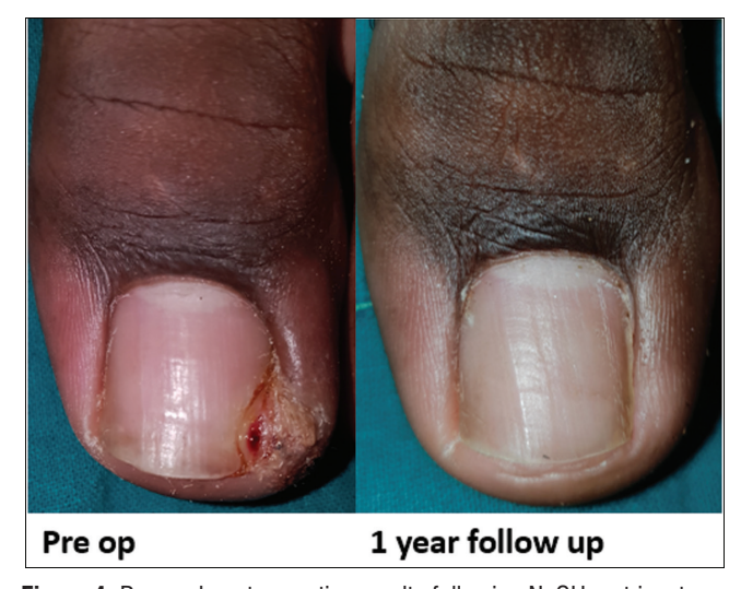
Figure 4: Pre- and post-operative results following NaOH matricectomy

All the participants were satisfied with the outcome with no recurrence at 1 year follow up.