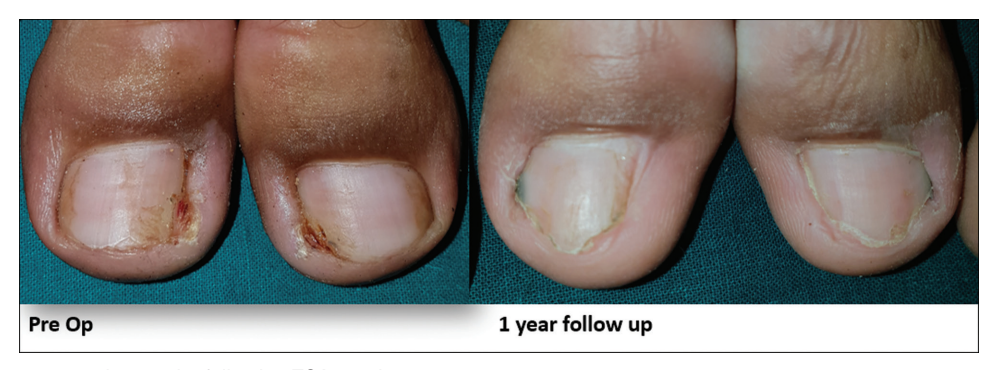
Figure 3: Pre- and post-operative results following TCA matricectomy