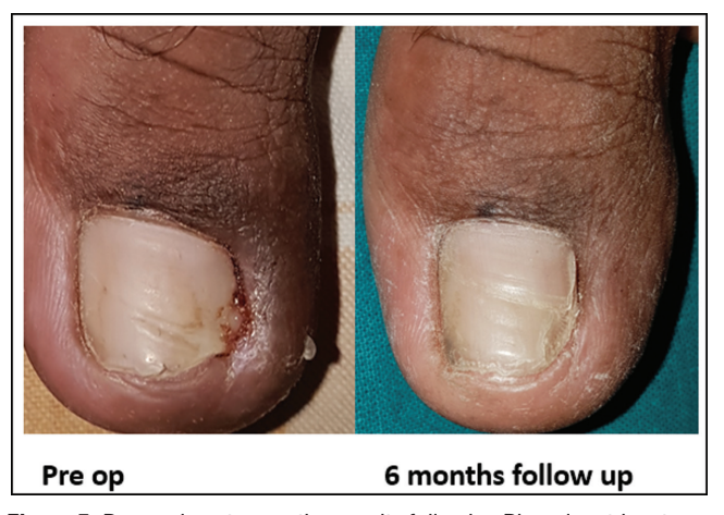
Figure 5: Pre- and post-operative results following Phenol matricectomy