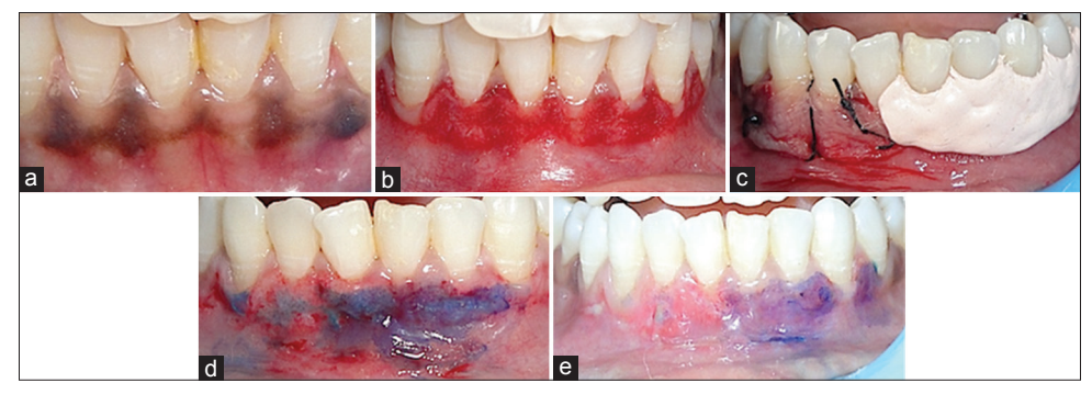
Figure 5: (a) Dummett moderate gingival pigmentation at presentation in mandibular arch, (b) partial thickness flap on the facial surface of the gingiva of the mandibular gingiva, (c) the right half of the area (4<sup>th</sup> quadrant) was covered with platelet rich fibrin membrane and sutured with 5-0 suture and the left half (3<sup>rd</sup> quadrant) was covered with non-eugenol periodontal dressing (Coe-Pack), (d) toluidine blue test on 3<sup>rd</sup> day, (e) toluidine blue test on 5<sup>th</sup> day

Sutures were removed on the 3<sup>rd</sup> post-operative day. Wound healing was evaluated on the basis of healing index given by Landry et al. ,<sup>[9]</sup> visual analogue scale scores,<sup>[10]</sup> epithelization test with toluidine blue and histological evaluation by punch biopsy on 5<sup>th</sup> post-operative day at mid of 11 and 21 region in both the quadrants.