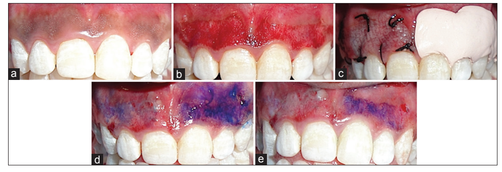
Figure 2: (a) Dummett moderate gingival pigmentation at presentation in maxillary arch, (b) partial thickness flap on the facial surface of the gingiva of the maxillary arch, (c) the right half of the area (1st quadrant) was covered with platelet rich fibrin membrane and sutured with 5-0 suture and the left half (2nd quadrant) was covered with non-eugenol periodontal dressing (Coe-Pack), (d) toluidine blue test on 3rd day, (e) toluidine blue test on 5th day