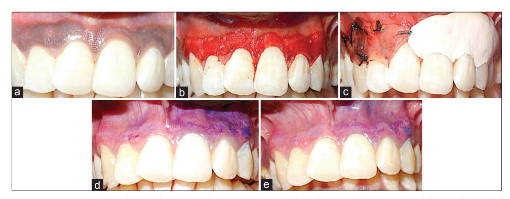
Figure 1: (a) Dummett moderate gingival pigmentation at presentation in maxillary arch, (b) partial thickness flap on the facial surface of the gingiva of the maxillary arch, (c) the right half of the area (1st quadrant) was covered with platelet rich fibrin membrane and sutured with 5-0 suture and the left half (2nd quadrant) was covered with non-eugenol periodontal dressing (Coe-Pack), (d) toluidine blue test on 3rd day, (e) toluidine blue test on 5th day

pigmentation was removed, exposing the underlying connective tissue [Figures 1b, 2b, 3b, 4b and 5b]. A split-mouth design was adopted and in all the patients the gingiva of 1<sup>st</sup> quadrant was covered with PRF membrane and sutured with 5-0 silk suture and that of 2<sup>nd</sup> quadrant was covered with a periodontal dressing (Coe-Pack) [Figures 1c, 2c, 3c, 4c and 5c]. The PRF was prepared according to the recommended protocol by Choukroun. [3]