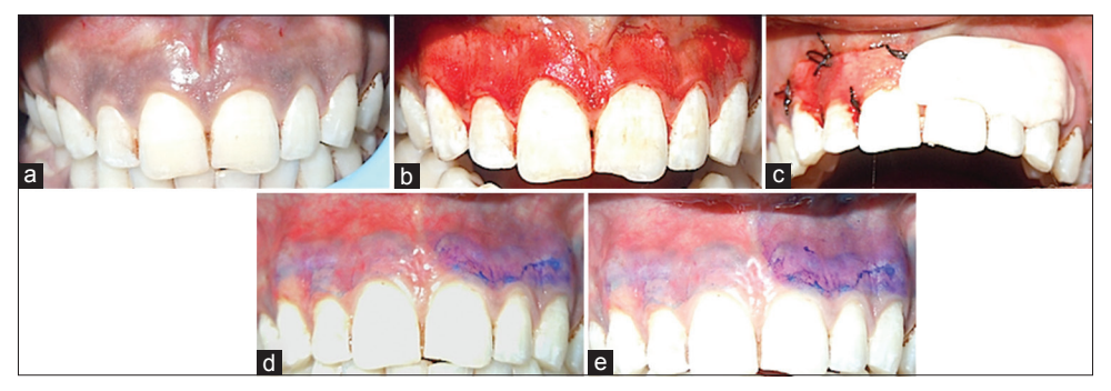
Figure 3: (a) Dummett moderate gingival pigmentation at presentation in maxillary arch, (b) partial thickness flap on the facial surface of the gingiva of the maxillary arch, (c) the right half of the area (1st quadrant) was covered with platelet rich fibrin membrane and sutured with 5-0 suture and the left half (2nd quadrant) was covered with non-eugenol periodontal dressing (Coe-Pack), (d) toluidine blue test on 3rd day, (e) toluidine blue test on 5th day