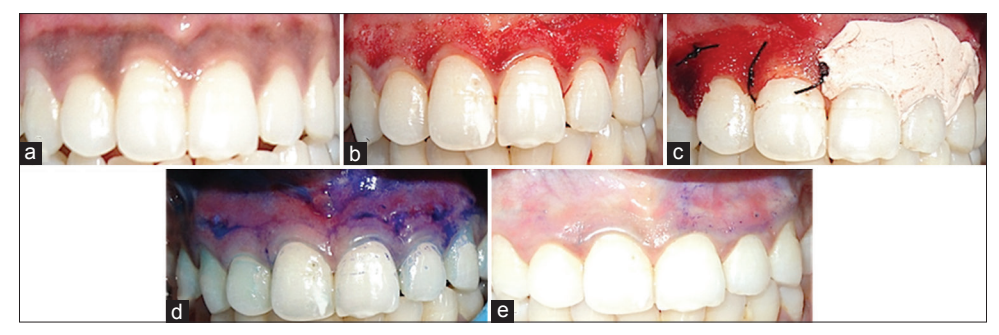
Figure 4: (a) Dummett moderate gingival pigmentation at presentation in maxillary arch, (b) partial thickness flap on the facial surface of the gingiva of the maxillary arch, (c) the right half of the area (1st quadrant) was covered with platelet rich fibrin membrane and sutured with 5-0 suture and the left half (2nd quadrant) was covered with non-eugenol periodontal dressing (Coe-Pack), (d) toluidine blue test on 3rd day, (e) toluidine blue test on 5th day