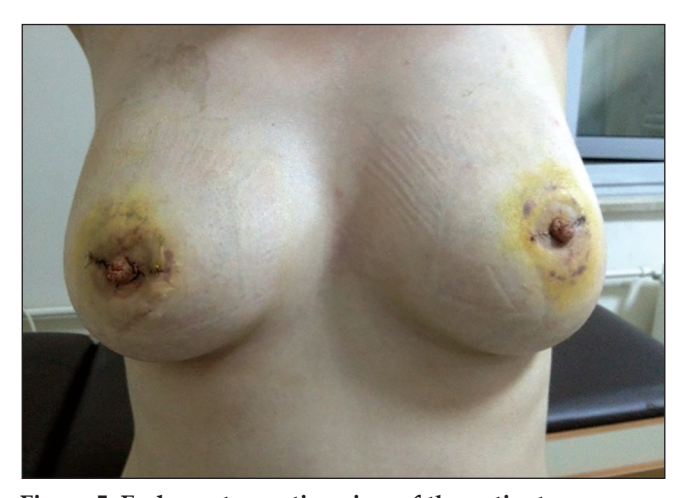
Figure 5: Early postoperative view of the patient

performed until the inversion does not recur without traction. The lactiferous ducts are mildly retracted and do not need to be cut for the release of fibrosis in the majority of the patients. A temporary traction suture with a suitable dressing is generally preferred after surgery for 2 weeks. In grade 3 cases, the nipple can hardly be pulled out manually due to the severe fibrosis. For correcting grade 3 cases, the fibrotic bands and lactiferous ducts are widely dissected and cut. Two or three deepithelialised dermal flaps should be used to make up for soft tissue deficiency after the release of fibrotic bands and a traction suture is also applied postoperatively.