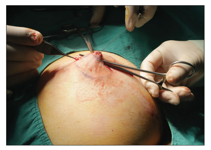
Figure 3: The conic-shape triangular flaps on both sides of the inverted nipple were turned down and advanced through the tunnel beneath the nipple as the filling tissue for the dead space