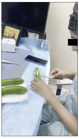
Video 1: Demonstration Video.